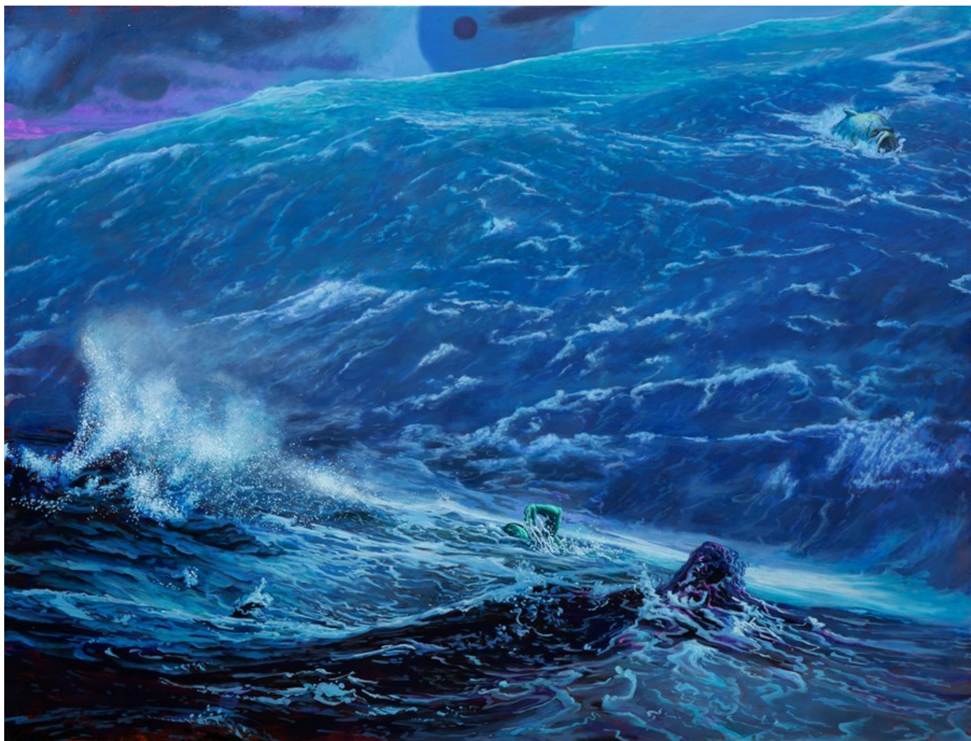
"Follow the Star" 2025, Oil on Linen, 81 x 107 cm, 32 x 42 in

GALLERY POULSEN CONTEMPORARY FINE ARTS - COPENHAGEN