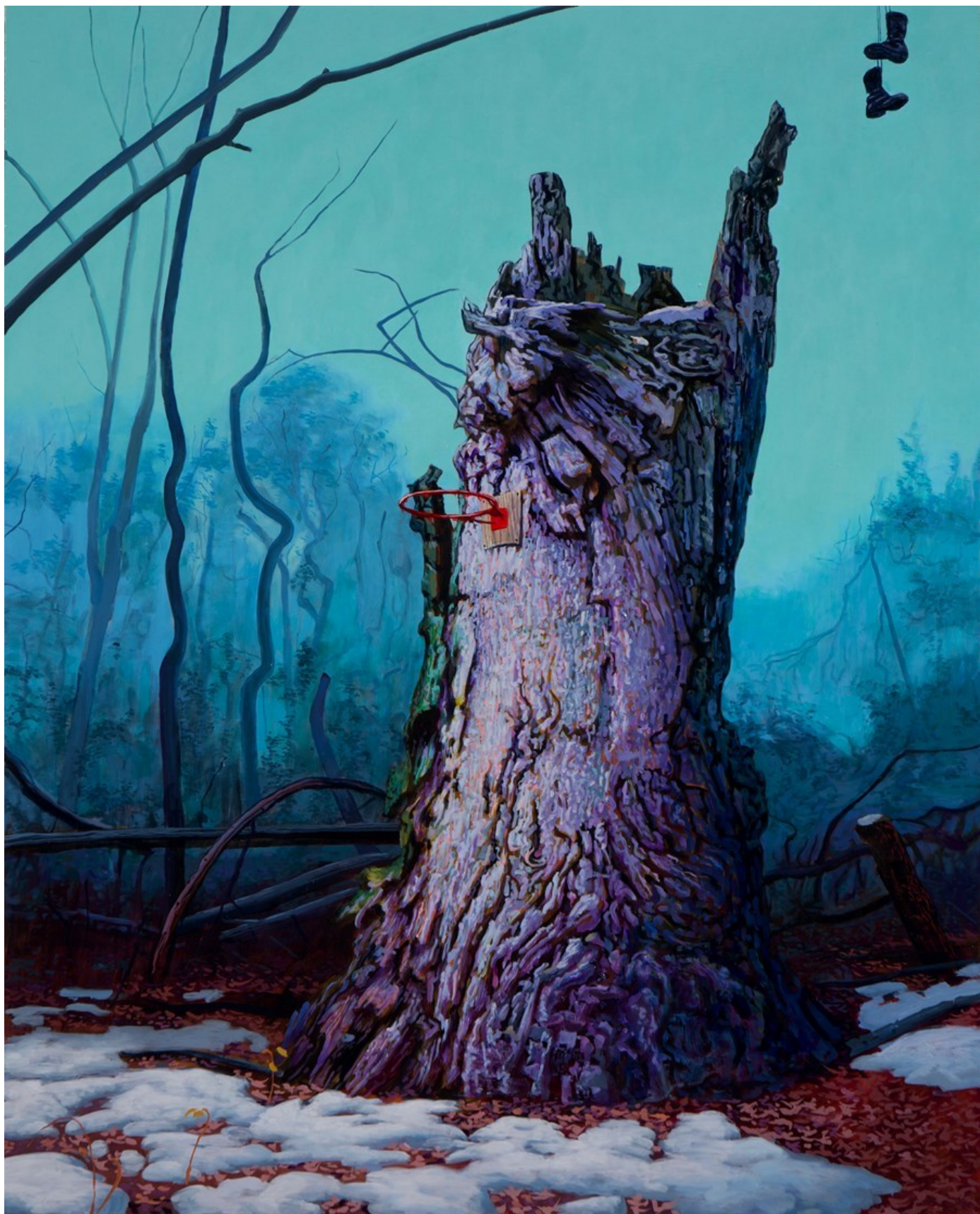
"Grey Mind" 2024, Oil on panel, 76 x 61 cm, 30 x 24 in

GALLERY POULSEN CONTEMPORARY FINE ARTS - COPENHAGEN