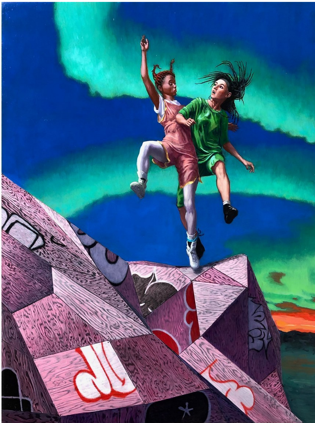
"Great Feat" 2021, Oil on panel, 61 x 46 cm, 24 x 18 in

GALLERY POULSEN CONTEMPORARY FINE ARTS - COPENHAGEN