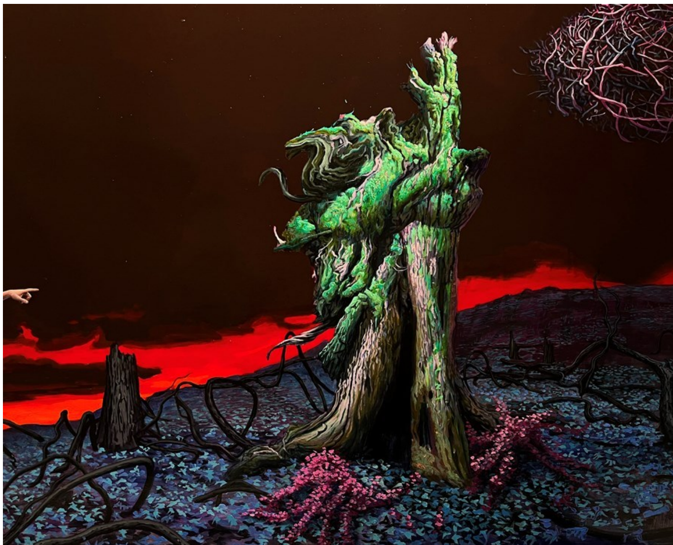
"Oracle" 2023, Oil on panel, 61 x 76 cm, 24 x 30 in

GALLERY POULSEN CONTEMPORARY FINE ARTS - COPENHAGEN