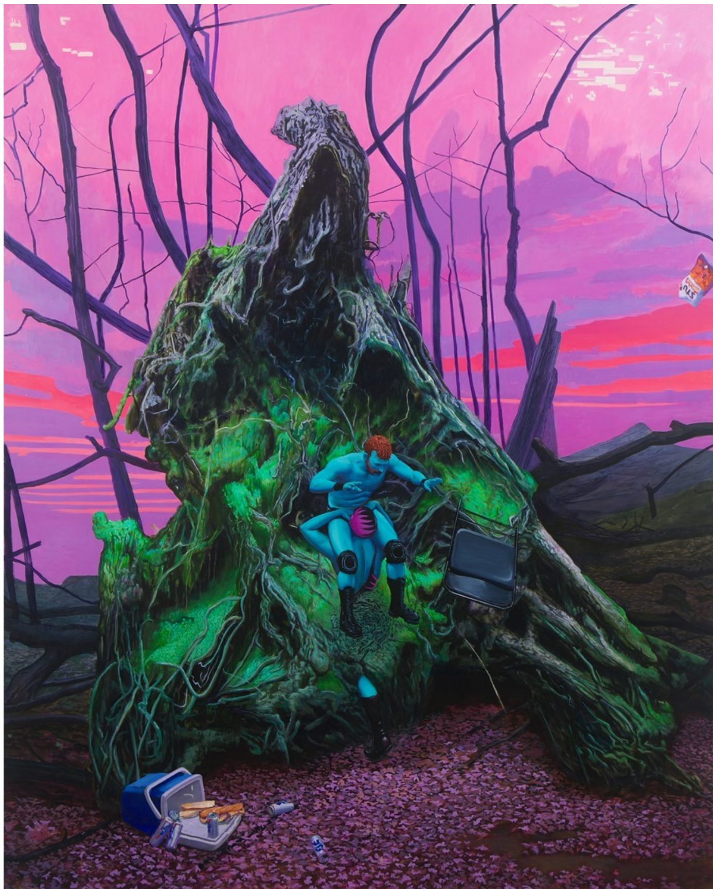
"Bad Picnic" 2023, Oil on linen - 152,5 x 122 cm, 60 x 48 in, $14,000 (+ 5% Danish art tax)

GALLERY POULSEN CONTEMPORARY FINE ARTS - COPENHAGEN