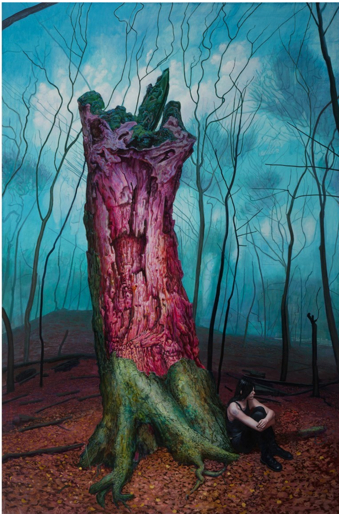
"Starfish" 2022, Oil on linen, 152,5 x 101,5 cm, 60 x 40 in

GALLERY POULSEN CONTEMPORARY FINE ARTS - COPENHAGEN