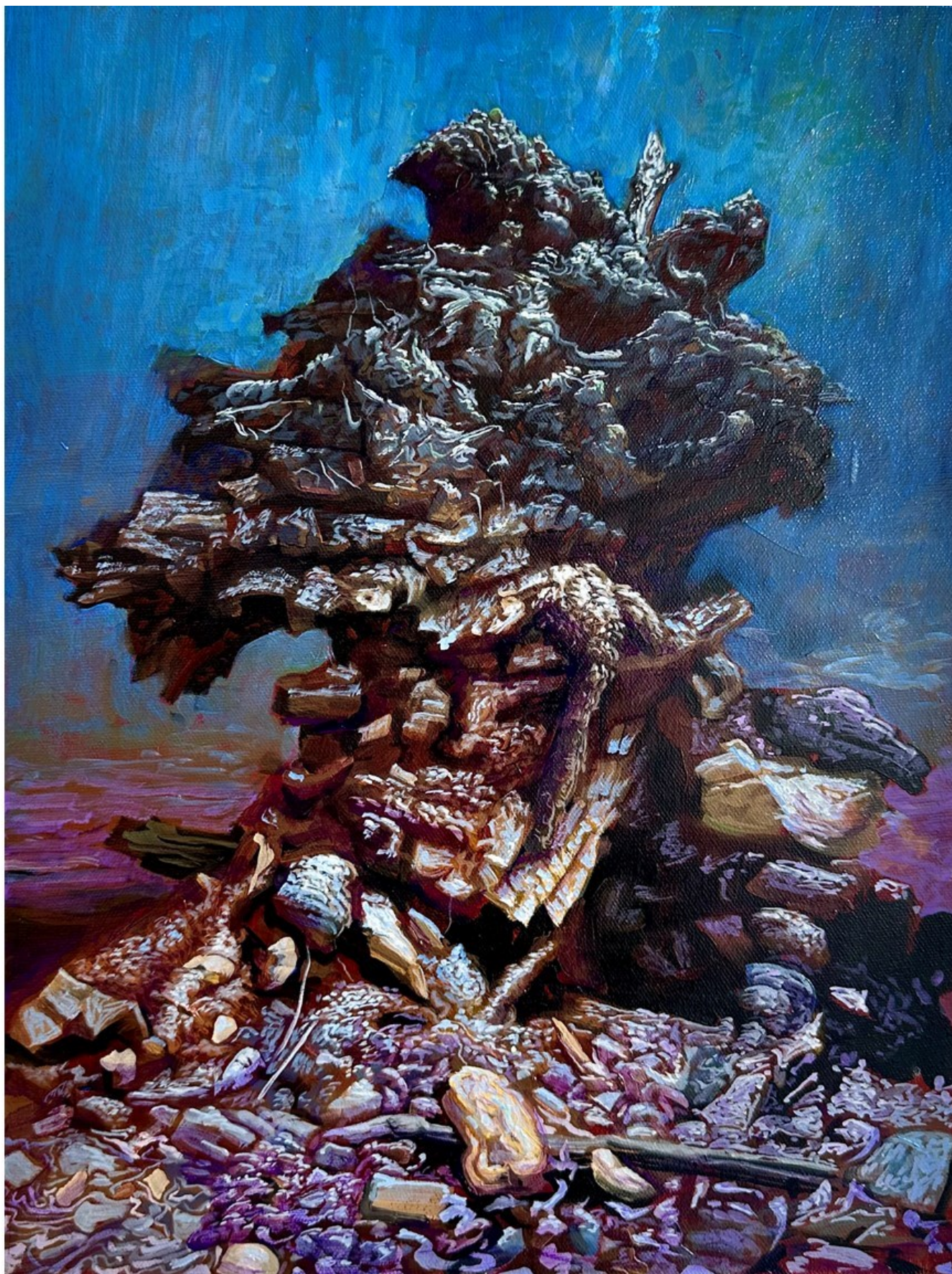
"Stable Condition" 2024, Oil on linen, 41 x 30,5 cm, 16 x 12 in

GALLERY POULSEN CONTEMPORARY FINE ARTS - COPENHAGEN