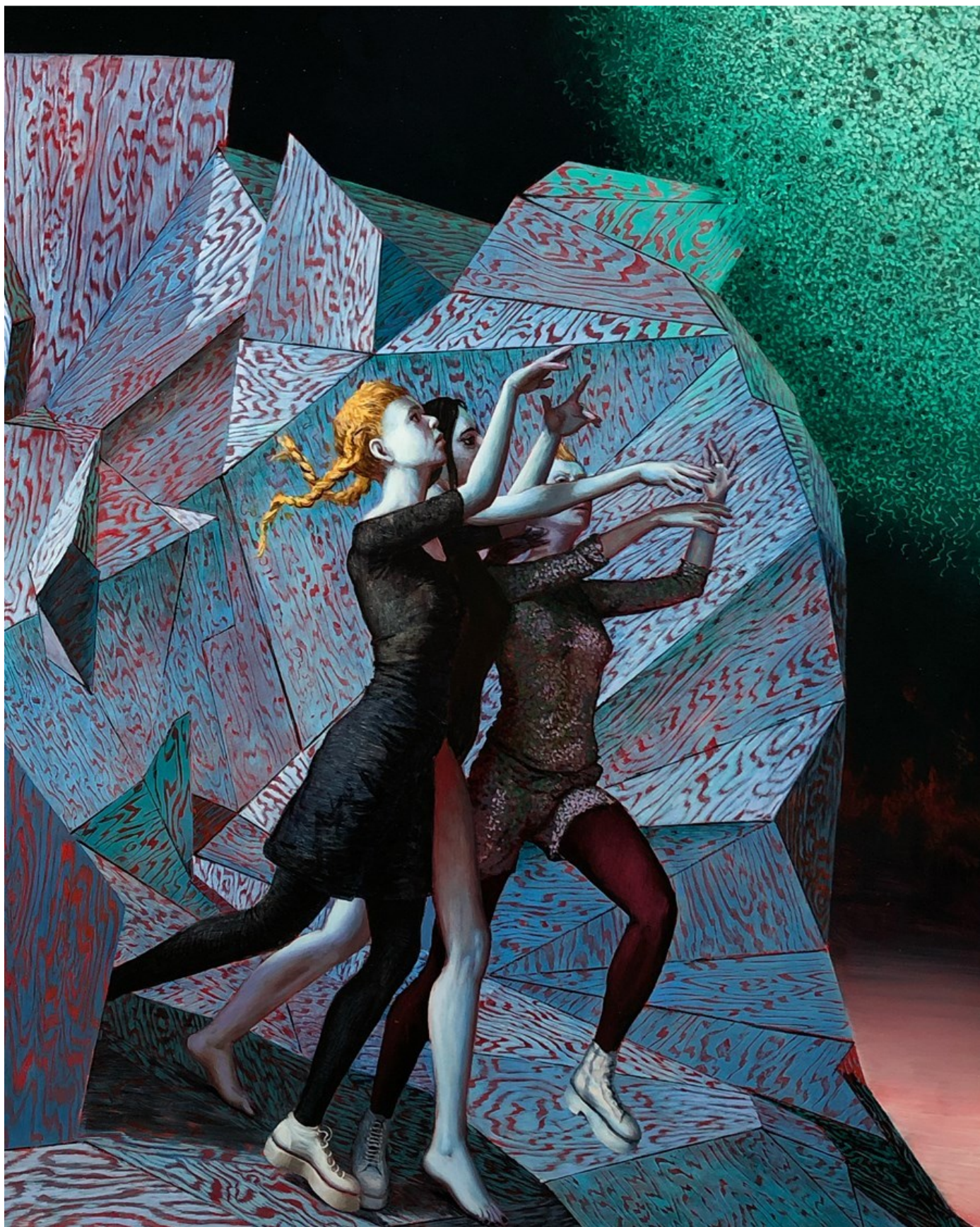
"Visitation" 2021, Oil on panel, 61 x 46 cm, 24 x 18 in

GALLERY POULSEN CONTEMPORARY FINE ARTS - COPENHAGEN