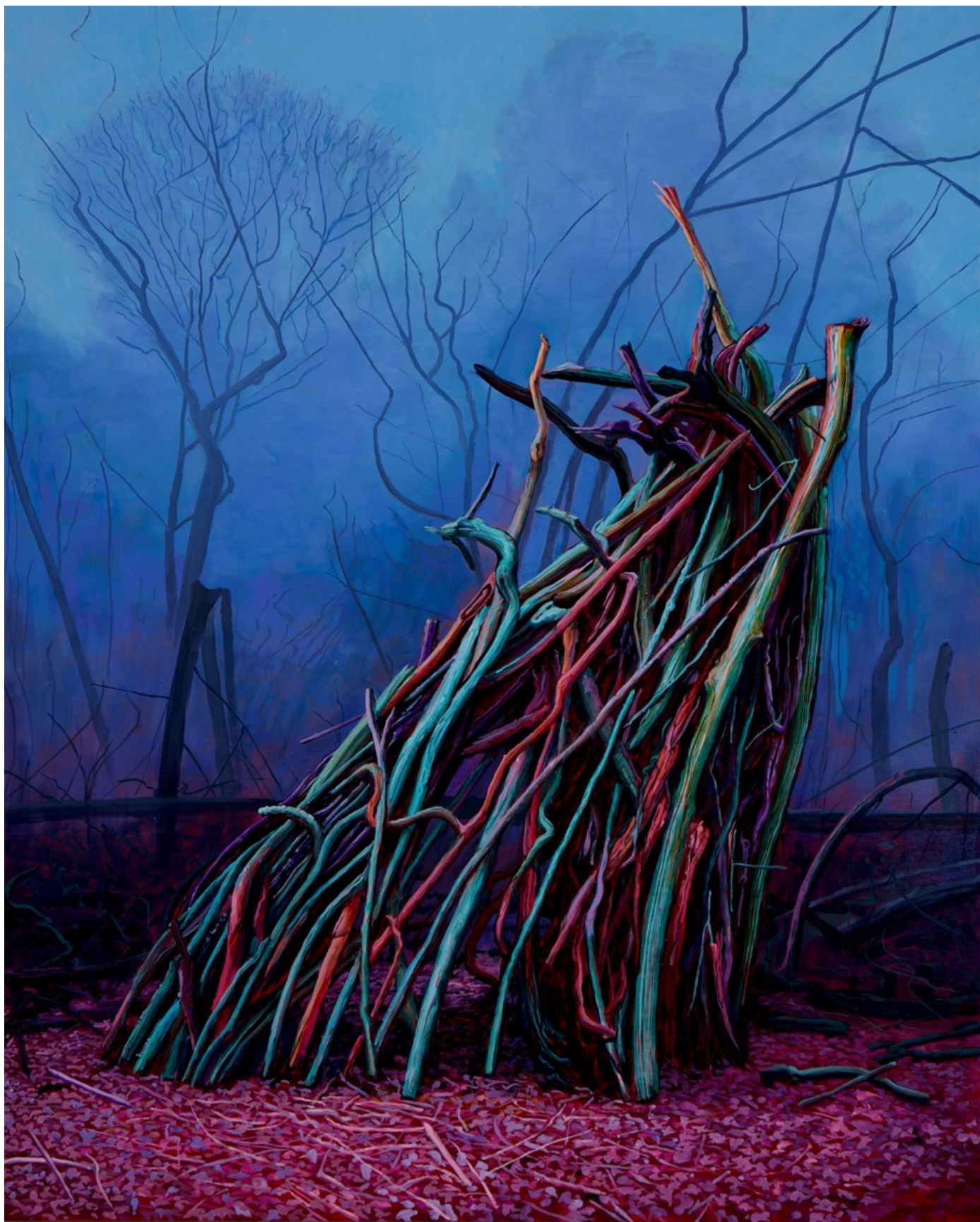
"Prism House" 2024, Oil on panel, 76 x 61 cm, 30 x 24 in

GALLERY POULSEN CONTEMPORARY FINE ARTS - COPENHAGEN