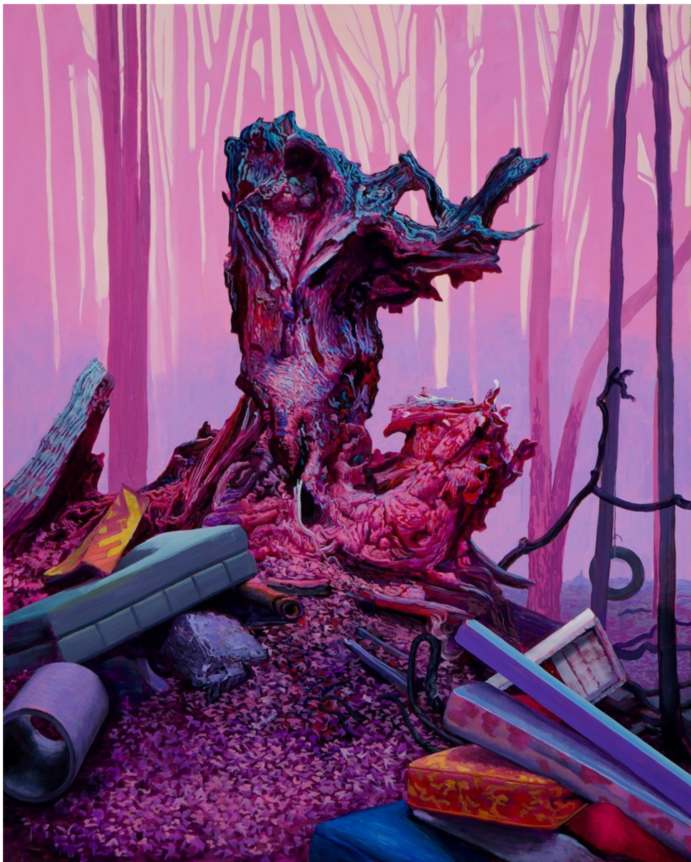
"Lullaby" 2024, Oil on panel, 76 x 61 cm, 30 x 24 in

GALLERY POULSEN CONTEMPORARY FINE ARTS - COPENHAGEN