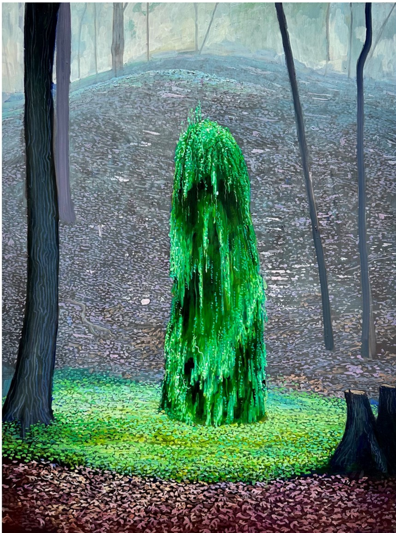
"Mist Mesh" 2024, Oil on panel, 61 x 46 cm, 24 x 18 in

GALLERY POULSEN CONTEMPORARY FINE ARTS - COPENHAGEN