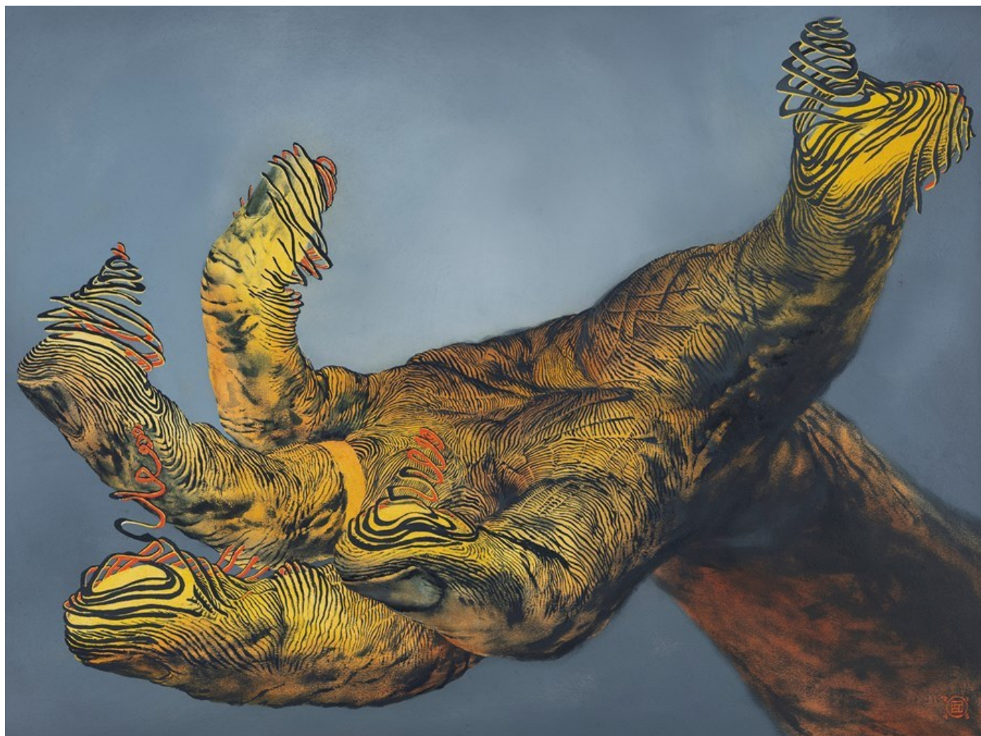
Unravel I, 2021., oil on arches paper,, 56 x 76 cm, 22 x 30 in

GALLERY POULSEN CONTEMPORARY FINE ARTS - COPENHAGEN