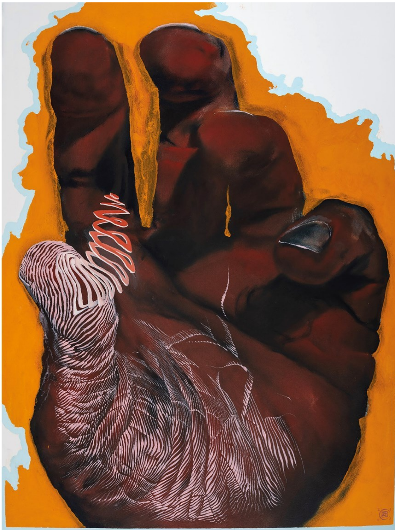
Unravel III, 2021,, oil on arches paper,, 76 x 56 cm, 30 x 22 in

GALLERY POULSEN CONTEMPORARY FINE ARTS - COPENHAGEN