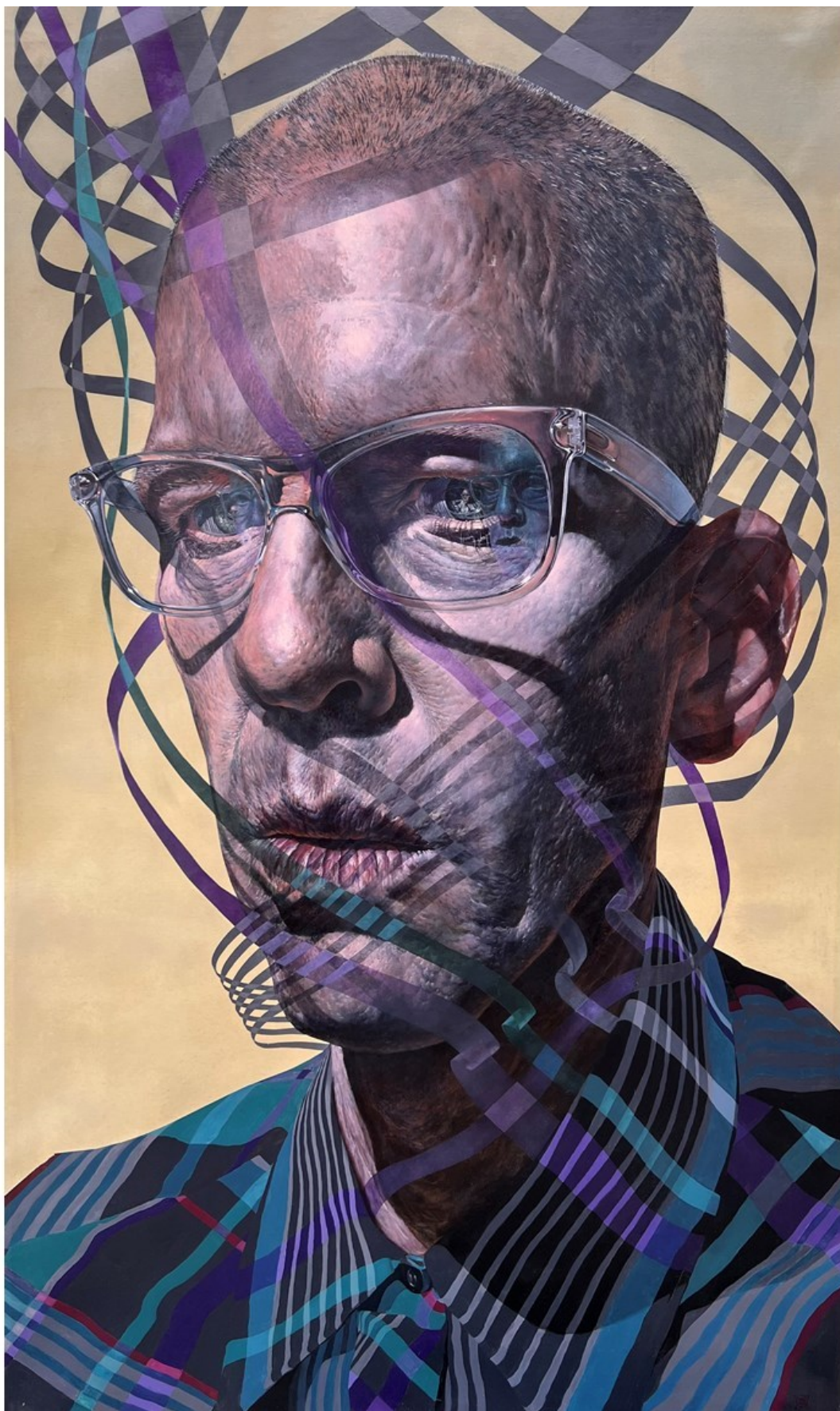
"Heald" 2022, Oil on linen, 184 x 109 cm, 72,5 in x 43 in

GALLERY POULSEN CONTEMPORARY FINE ARTS - COPENHAGEN