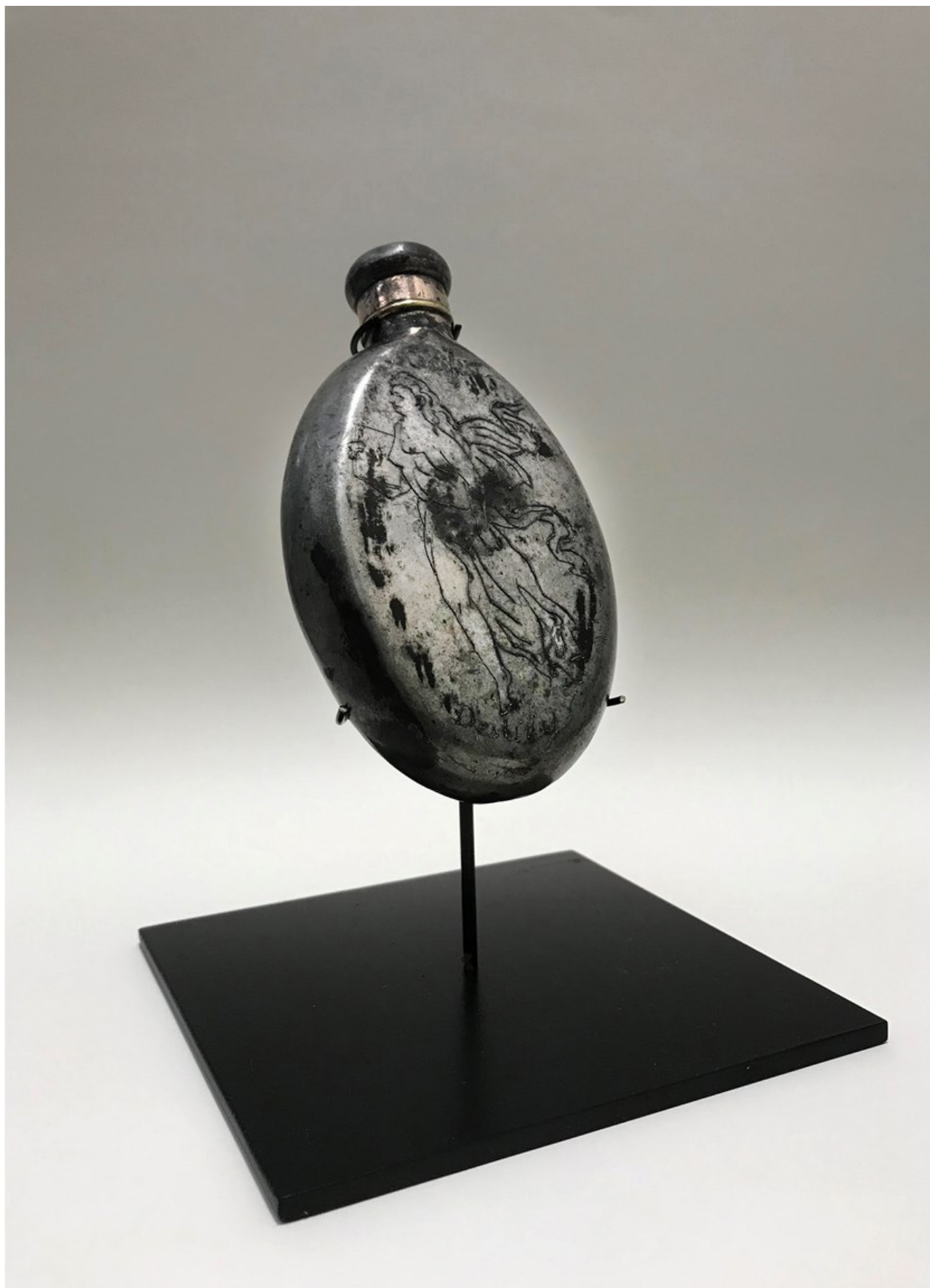
"Manifest Destiny" 2021, Artifact for "John's Up",

GALLERY POULSEN CONTEMPORARY FINE ARTS - COPENHAGEN