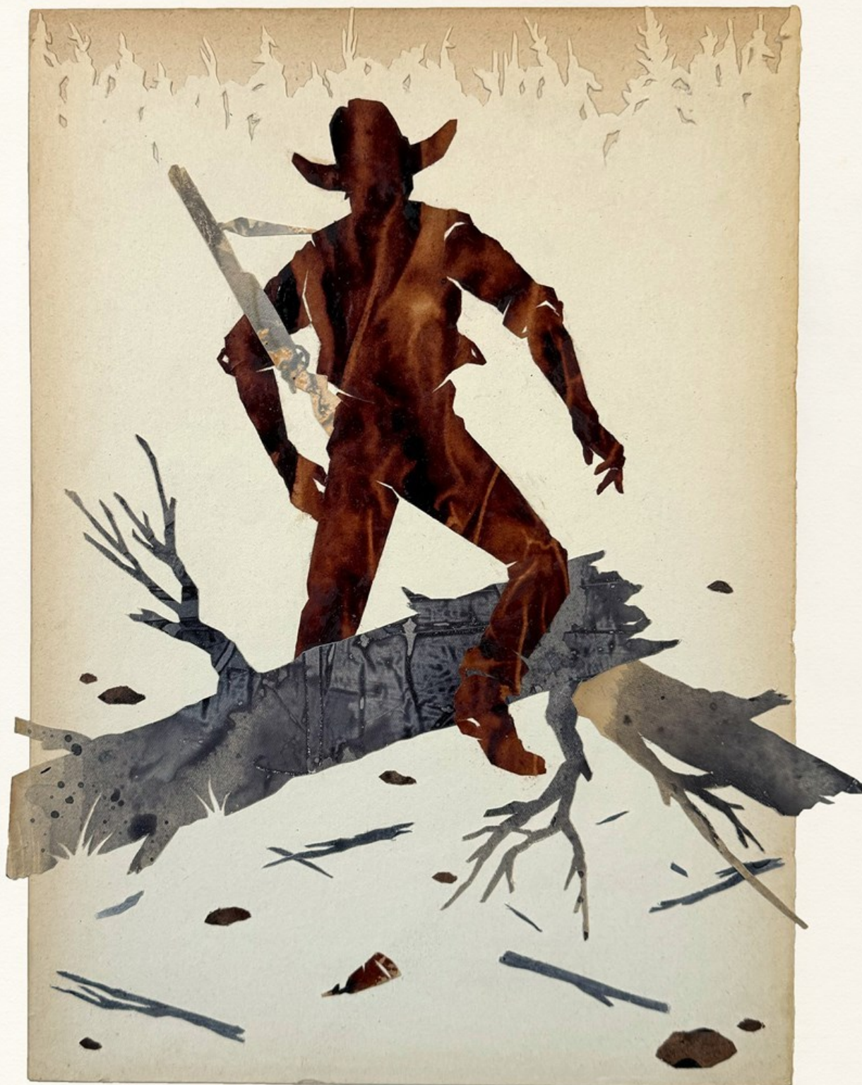
"Shellacked Cowboy XXXVII" 2024, Shellac ink on vintage paper mounted to panel, 41 x 31 cm, 16 x 12 in

GALLERY POULSEN CONTEMPORARY FINE ARTS - COPENHAGEN