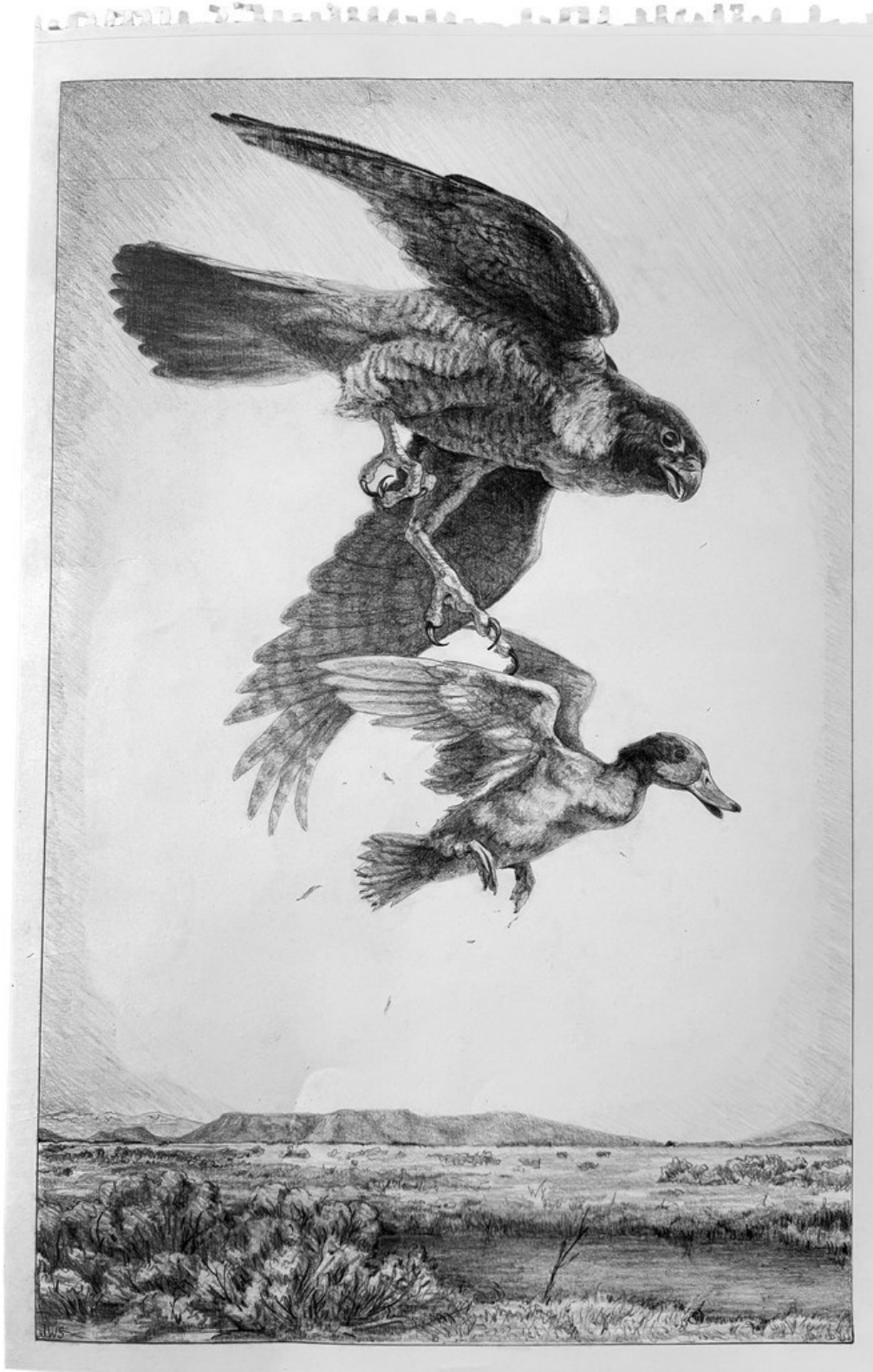
"Playa Blanca Compositional Drawing" 2025., Graphite on paper, 60 x 38 cm, 23,5 x 15 in, framed in handmade poplar frame

GALLERY POULSEN CONTEMPORARY FINE ARTS - COPENHAGEN