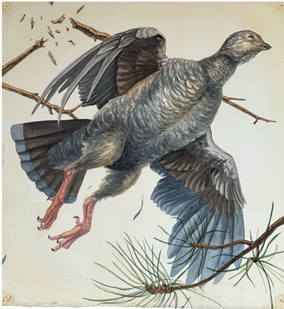
"Near Miss" 2025, Watercolor on paper mounted to canvas., 38 x 36 cm, 14 x 15 in

GALLERY POULSEN CONTEMPORARY FINE ARTS - COPENHAGEN