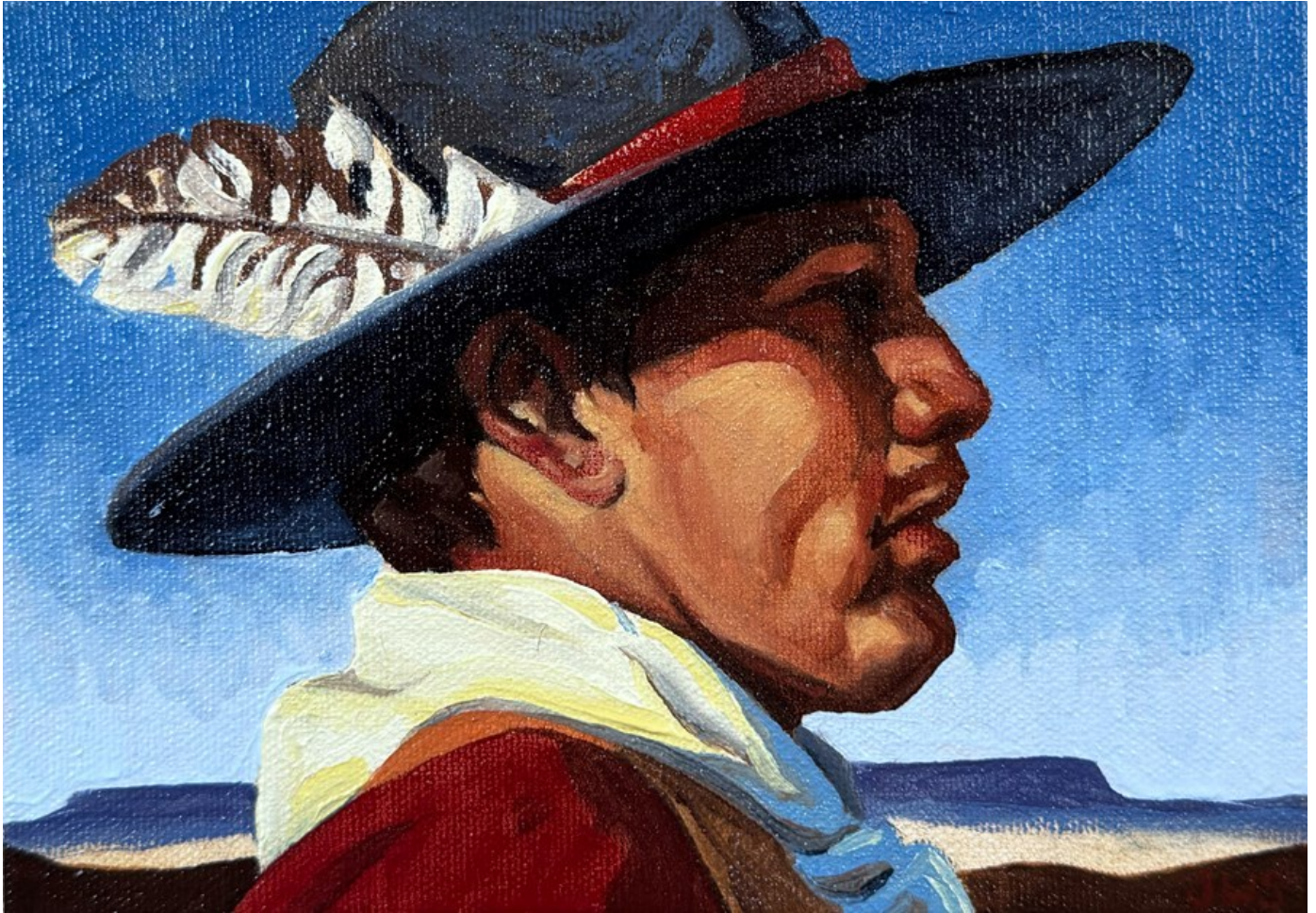
"Searching for Strays" 2025, Oil on canvas panel, 13 x 18 cm, 5 x 7 in, Framed in handmade walnut frame with double oak splined mitered joints

GALLERY POULSEN CONTEMPORARY FINE ARTS - COPENHAGEN