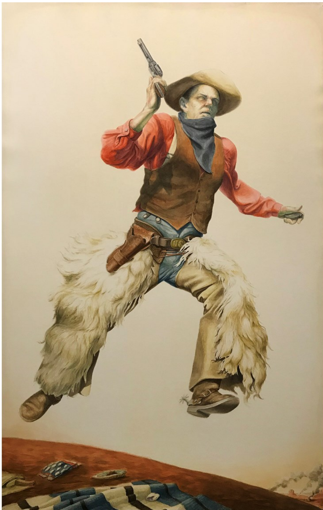
"John's Up" 2021, Watercolor on paper mounted to canvas, 203 x 132 cm, 80 x 52 in

GALLERY POULSEN CONTEMPORARY FINE ARTS - COPENHAGEN