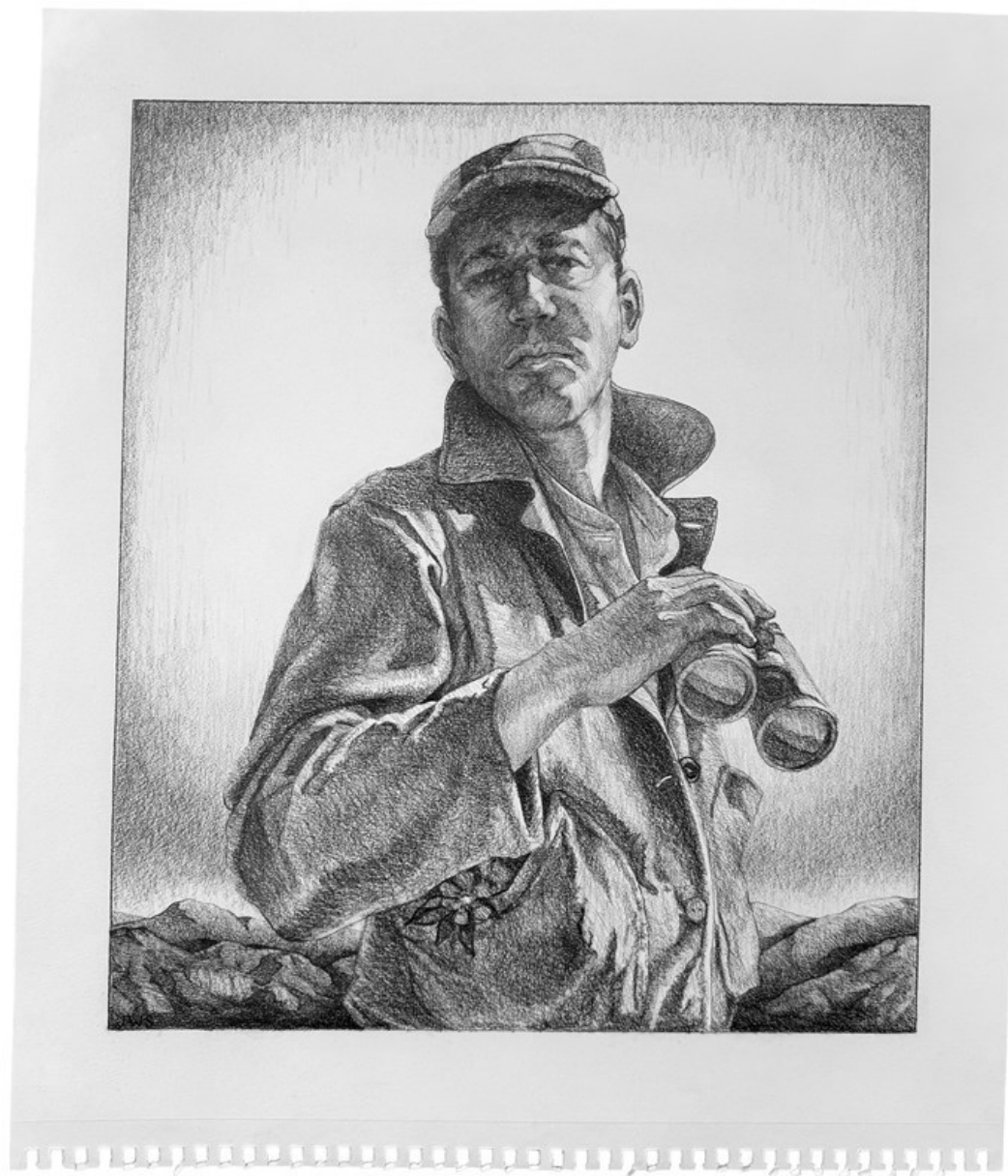
"Self Reflection Compositional Drawing", 2025, Graphite on paper, 41 x 35 cm, 16 x 14 in (unframed), Framed in handmade poplar frame

GALLERY POULSEN CONTEMPORARY FINE ARTS - COPENHAGEN