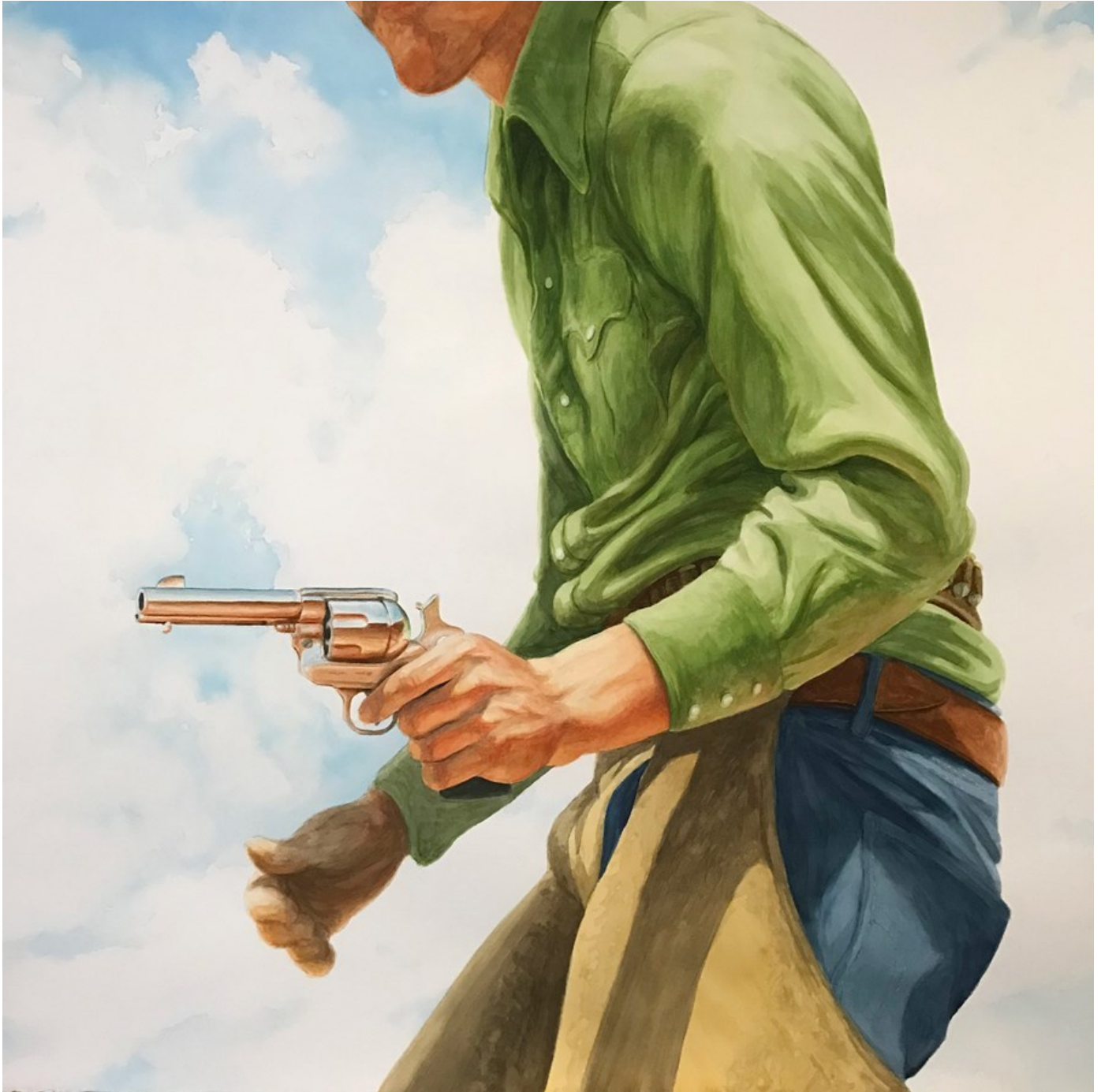
"Gutshot" 2021, Watercolor on paper mounted to canvas, 86,5 x 91,5 cm, 34 x 36 in