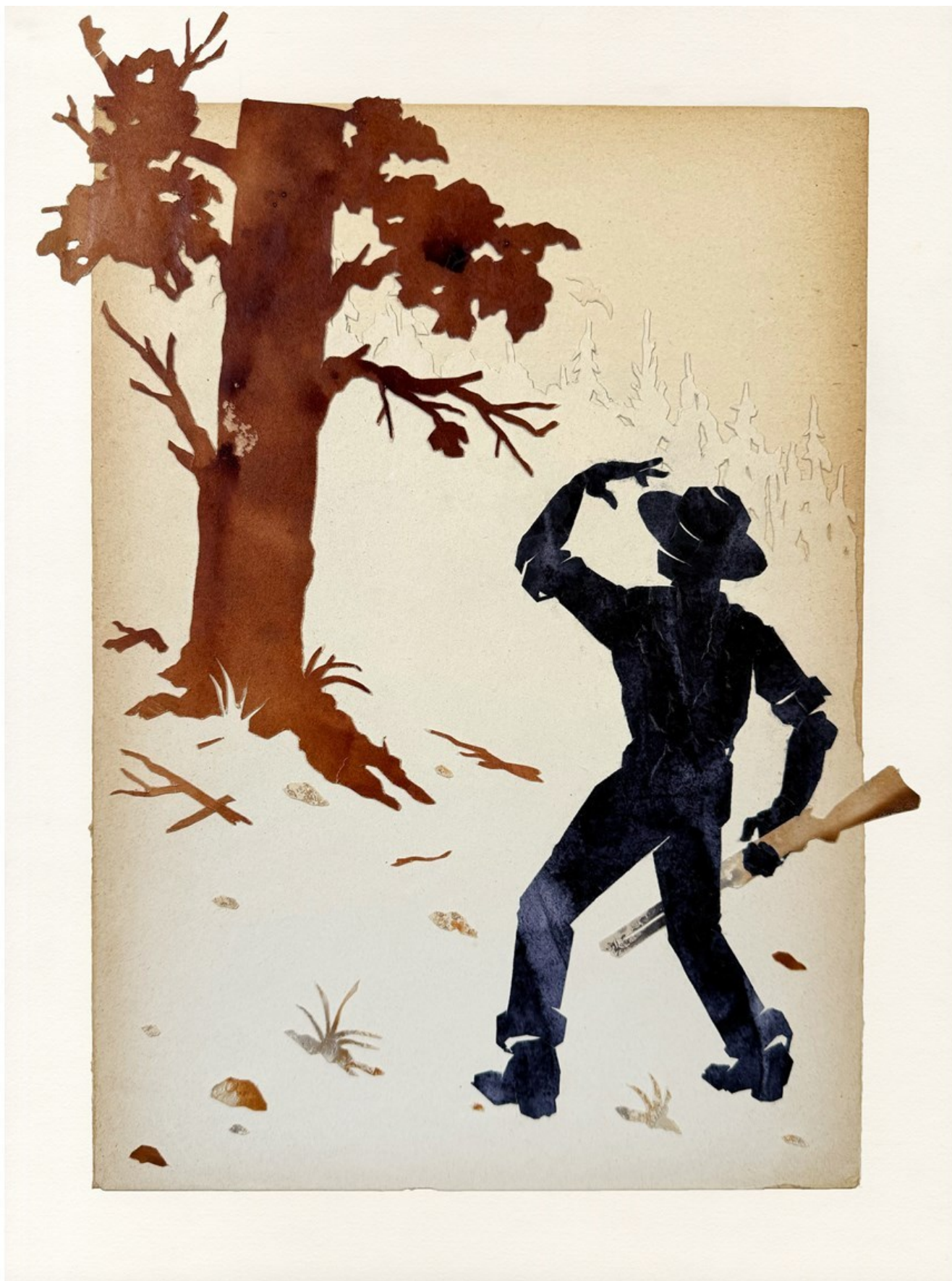
"Shellacked Cowboy XXXIV" 2024, Shellac ink on vintage paper mounted to panel, 41 x 31 cm, 16 x 12 in

GALLERY POULSEN CONTEMPORARY FINE ARTS - COPENHAGEN