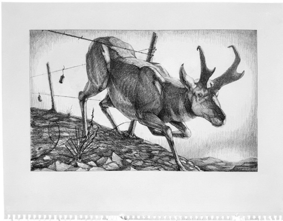
"Crossing Thru Compositional Drawing" 2025, Graphite on paper, 35 x 46 cm, 14 x 18 in, framed in handmade poplar frame

GALLERY POULSEN CONTEMPORARY FINE ARTS - COPENHAGEN