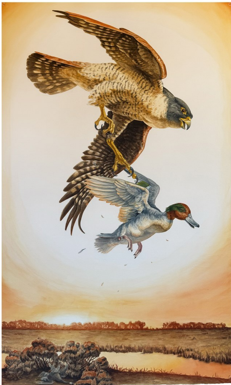
"Playa Blanca" 2025, Watercolor on paper mounted to canvas, 104 x 64 cm, 41 x 25 in

GALLERY POULSEN CONTEMPORARY FINE ARTS - COPENHAGEN