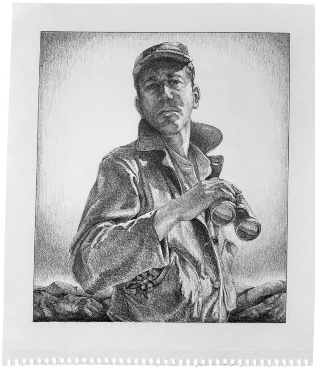
"Self Reflection Compositional Drawing", 2025, Graphite on paper, 41 x 35 cm, 16 x 14 in (unframed), Framed in handmade poplar frame

GALLERY POULSEN CONTEMPORARY FINE ARTS - COPENHAGEN