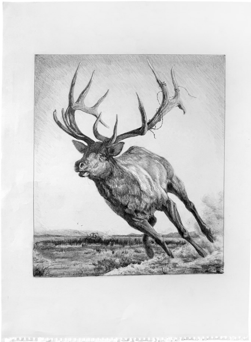
"Shifting Winds Compositional Drawing" 2025, Graphite on paper, 56 x 41 cm, 22 x 16 in (unframed), Handmade poplar frame

GALLERY POULSEN CONTEMPORARY FINE ARTS - COPENHAGEN