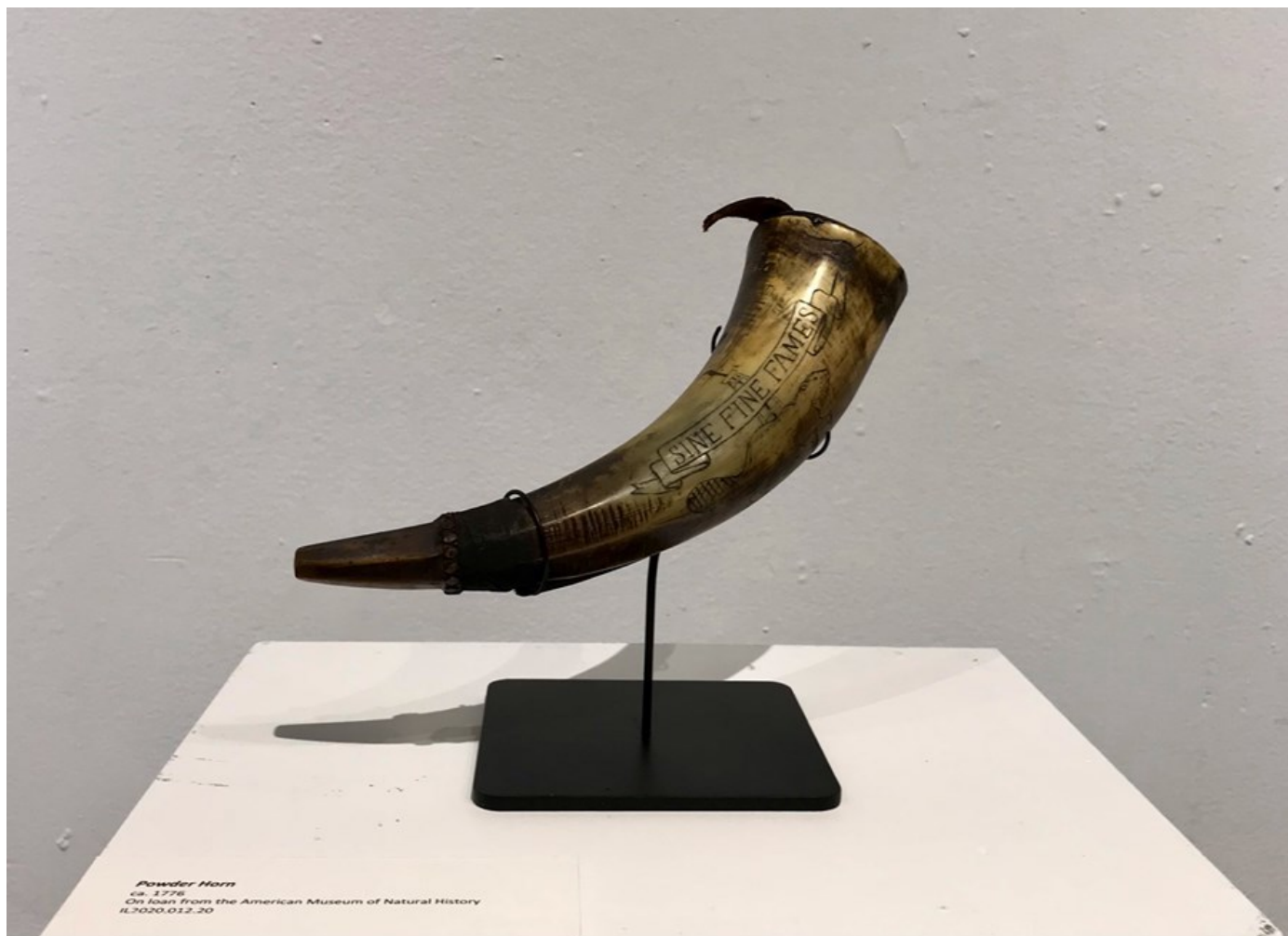
"Sine Fine Fames" 2021, Animal horn, leather, brass and lampblack, 28 x 18 cm, 11 x 7 in