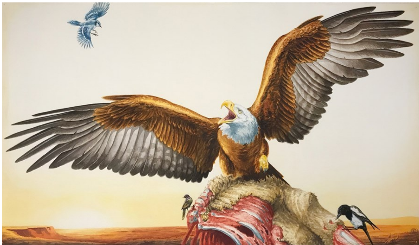
"The Wolfers Cannon Fodder" 2023, Watercolor on paper mounted on canvas, 61 x 106,5 cm, 24 x 42 in

GALLERY POULSEN CONTEMPORARY FINE ARTS - COPENHAGEN