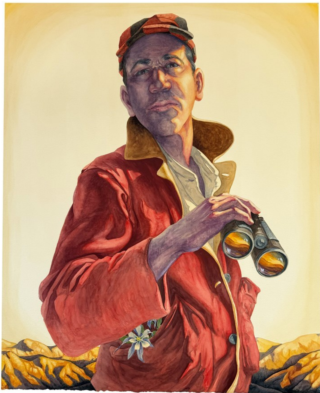
"Self Reflection" 2025, Watercolor on paper mounted to canvas, 93 x 77 cm, 36,5 x 30 in

GALLERY POULSEN CONTEMPORARY FINE ARTS - COPENHAGEN