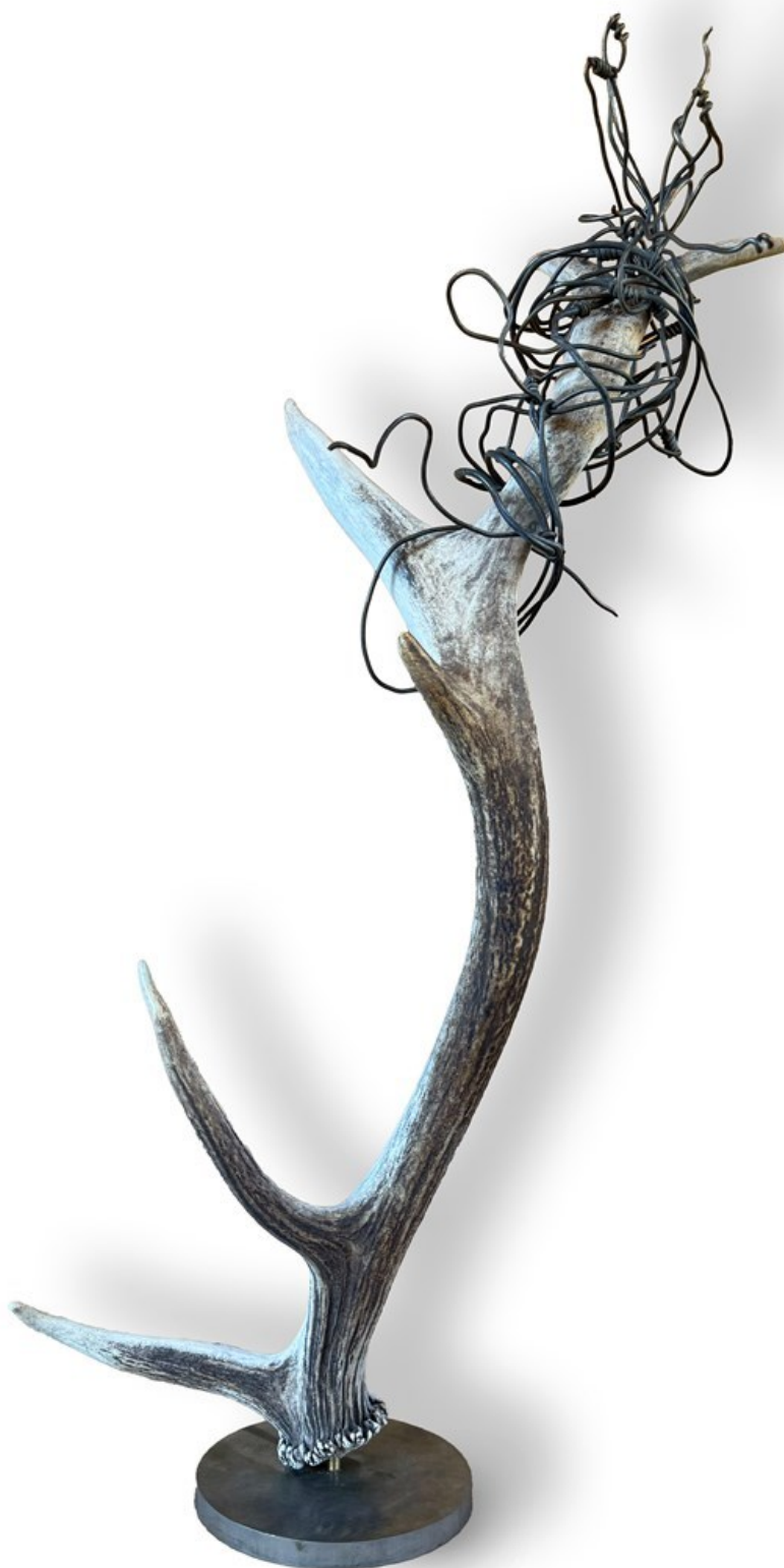
"The Antler" 2025, Elk antler, barbed wire, steel and brass, 77 x 41 x 31 cm, 31 x 16 x 12 in

GALLERY POULSEN CONTEMPORARY FINE ARTS - COPENHAGEN