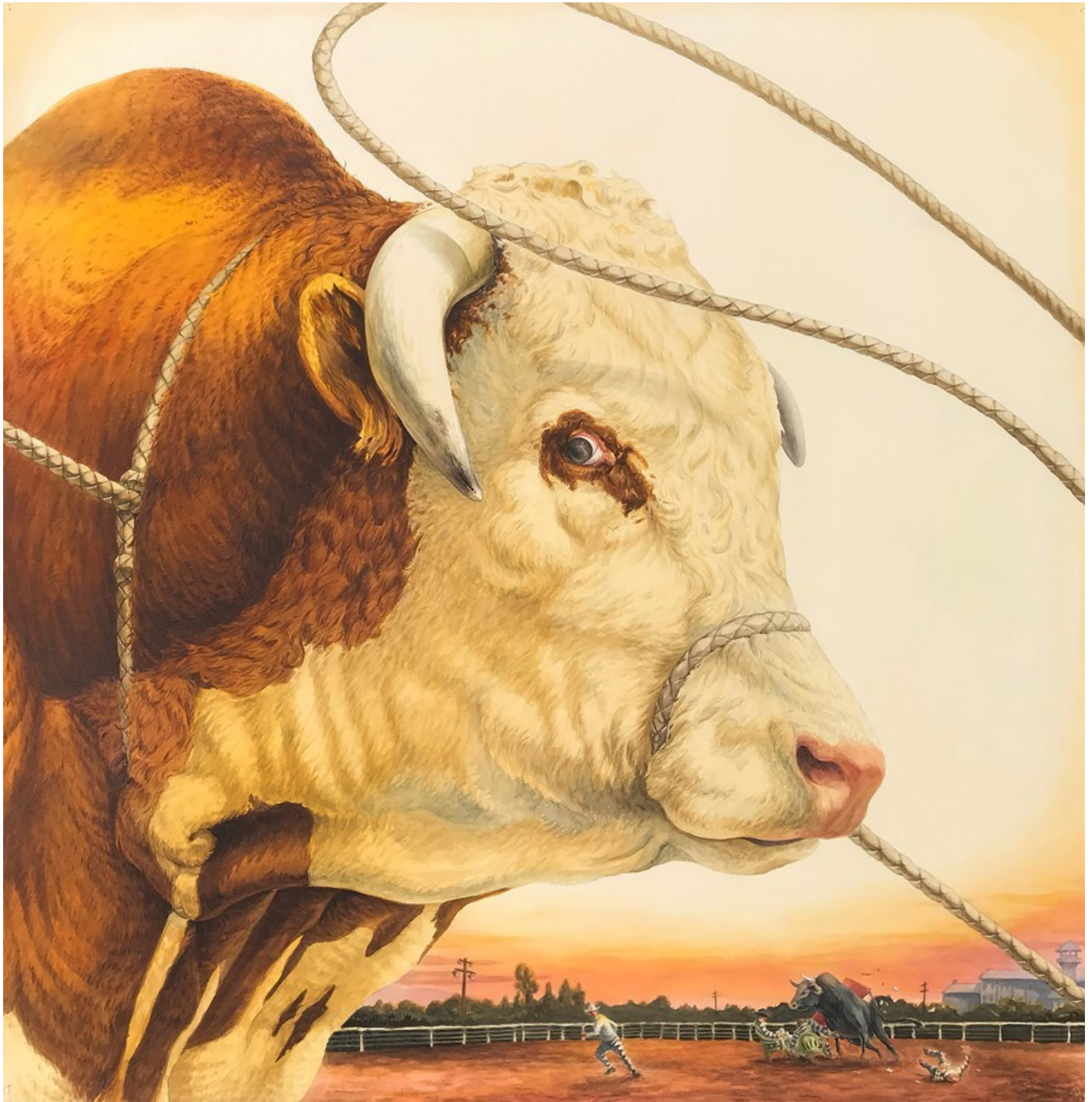
"Cowboy Poker" 2023, Watercolor on paper mounted to canvas, 101,5 x 101,5 cm, 40 x 40 in

GALLERY POULSEN CONTEMPORARY FINE ARTS - COPENHAGEN