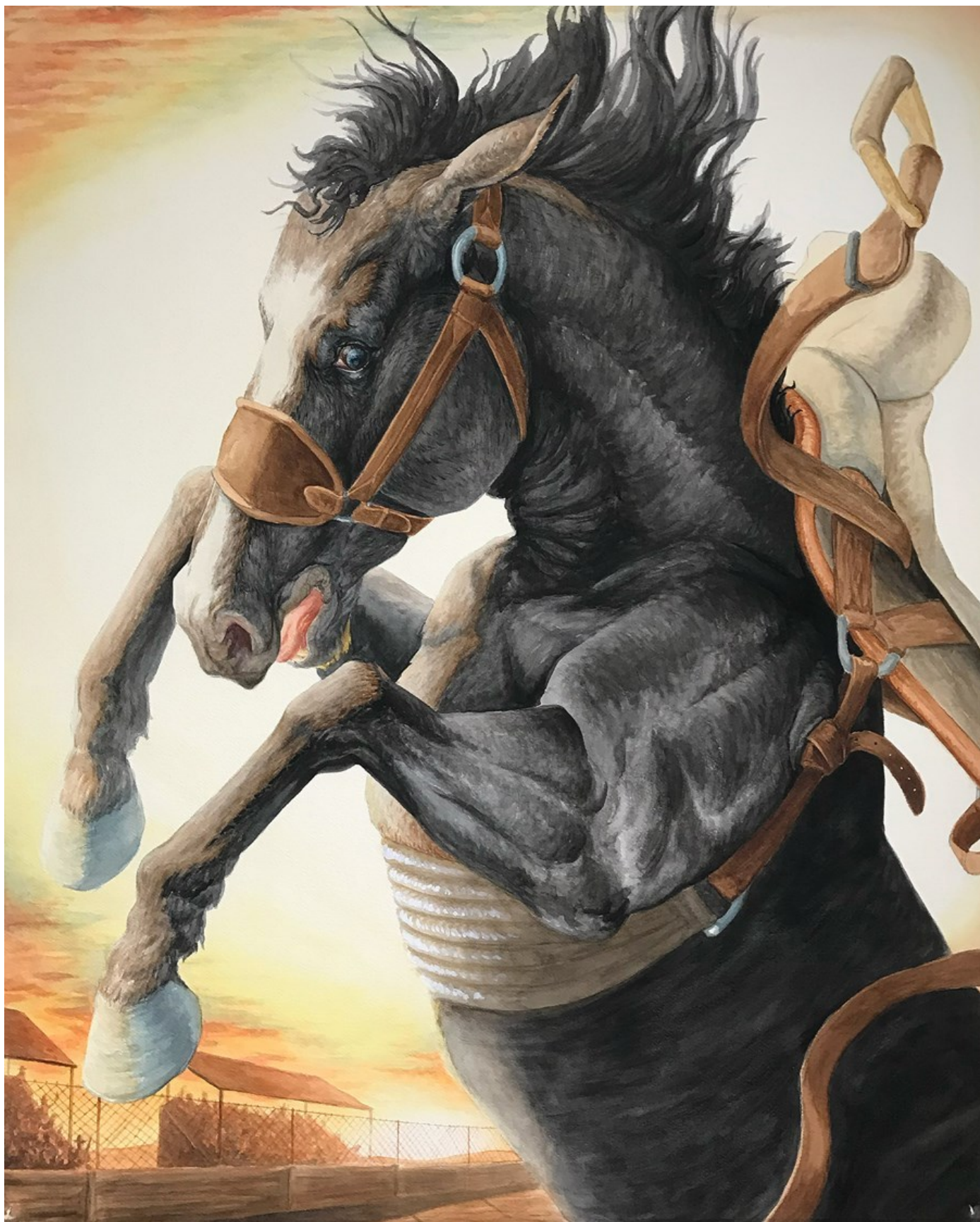
"Five Seconds of Freedom" 2023, Watercolor on paper mounted to canvas, 87,5 x 72 cm, 34,5 x 28,5 in

GALLERY POULSEN CONTEMPORARY FINE ARTS - COPENHAGEN