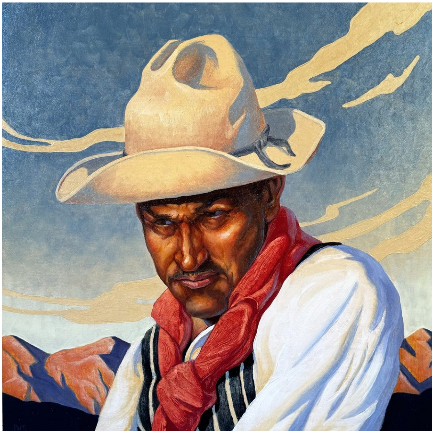
"Gaucho" 2025, Oil on panel, 46 x 46 cm, 18 x 18 in, Framed in handmade walnut frame with double oak splined mitered joints

GALLERY POULSEN CONTEMPORARY FINE ARTS - COPENHAGEN