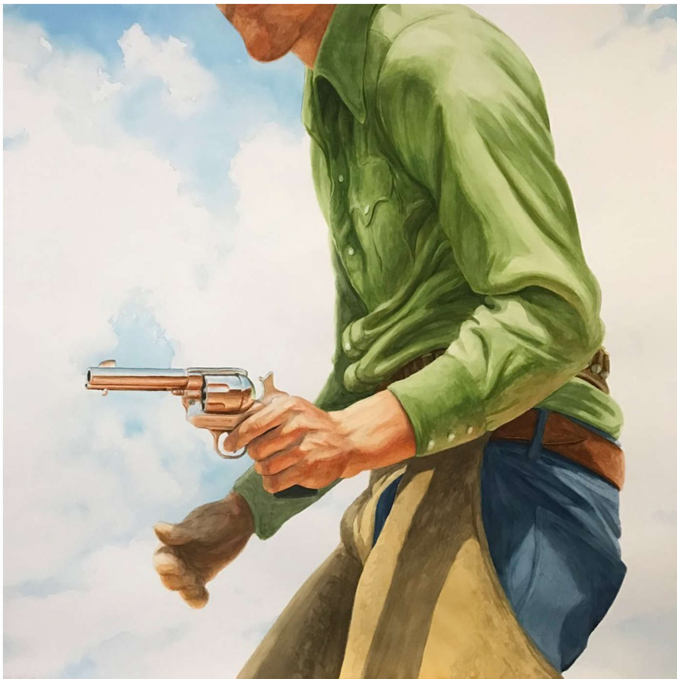
"Gutshot" 2021, Watercolor on paper mounted to canvas, 86,5 x 91,5 cm, 34 x 36 in