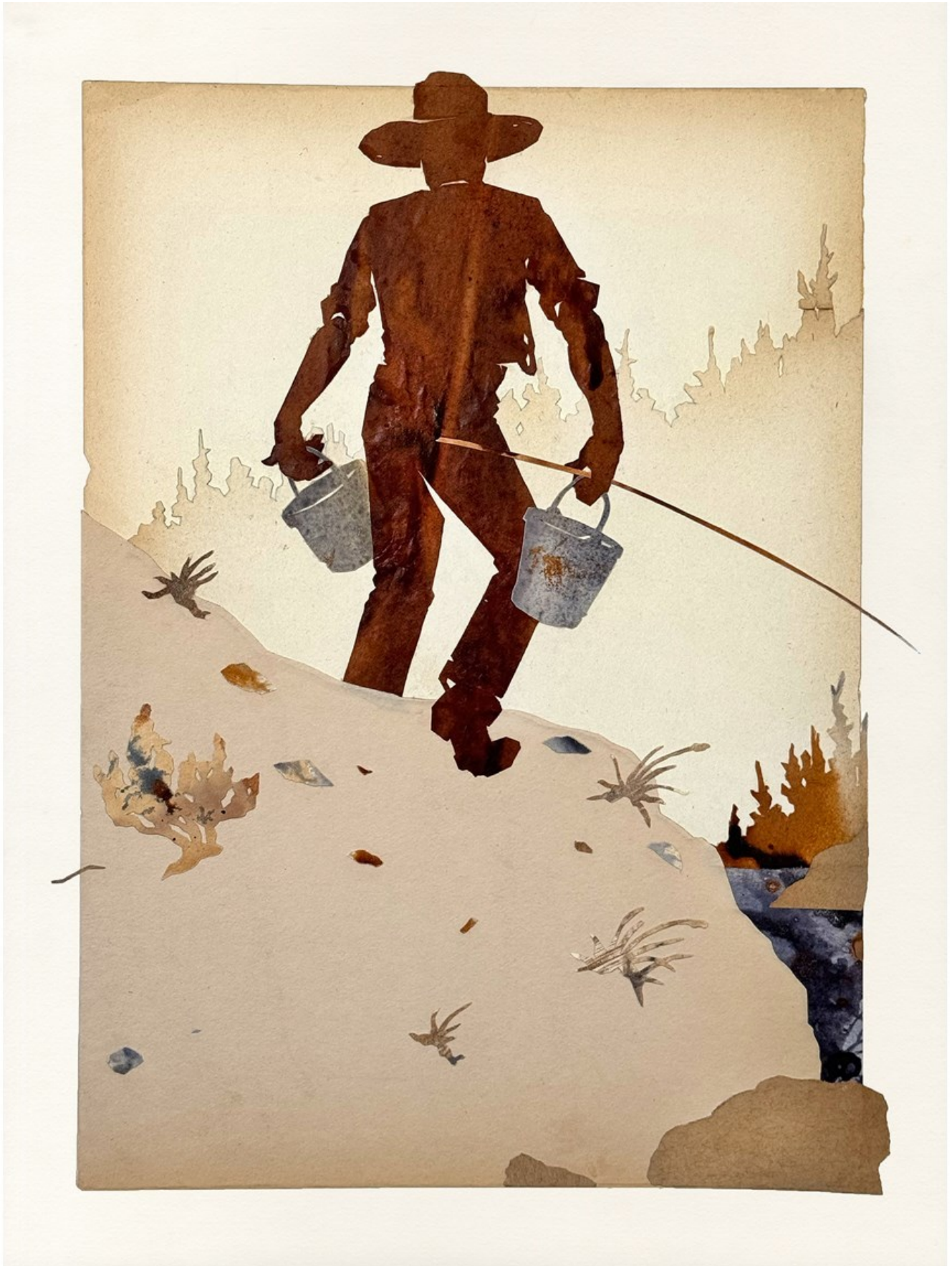
"Shellacked Cowboy XLV" 2026,, Shellac ink on vintage paper mounted to panel,, 41 x 30 cm, 16 x 12 in,

GALLERY POULSEN CONTEMPORARY FINE ARTS - COPENHAGEN