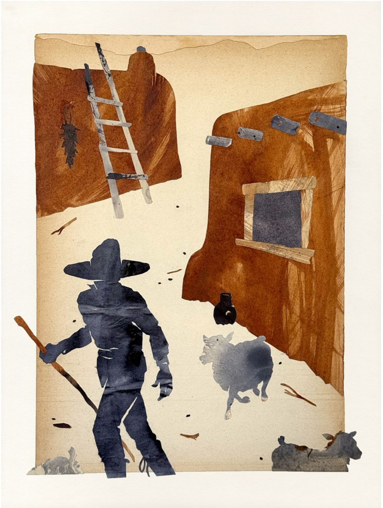
"Shellacked Cowboy XLV3" 2026., Shellac ink on vintage paper mounted to panel., 41 x 30 cm, 16 x 12 in,

GALLERY POULSEN CONTEMPORARY FINE ARTS - COPENHAGEN