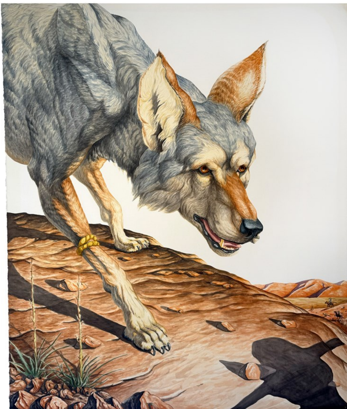
"La Incursi3n de los Lobos del Sauces" 2026, Watercolor on paper mounted to canvas, 138 x 114 cm, 54 x 45 in

GALLERY POULSEN CONTEMPORARY FINE ARTS - COPENHAGEN