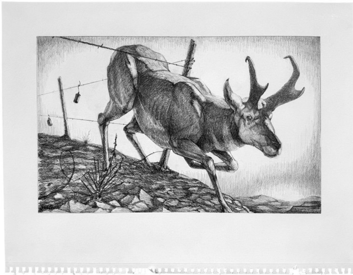
"Crossing Thru Compositional Drawing" 2025, Graphite on paper, 35 x 46 cm, 14 x 18 in, framed in handmade poplar frame

GALLERY POULSEN CONTEMPORARY FINE ARTS - COPENHAGEN