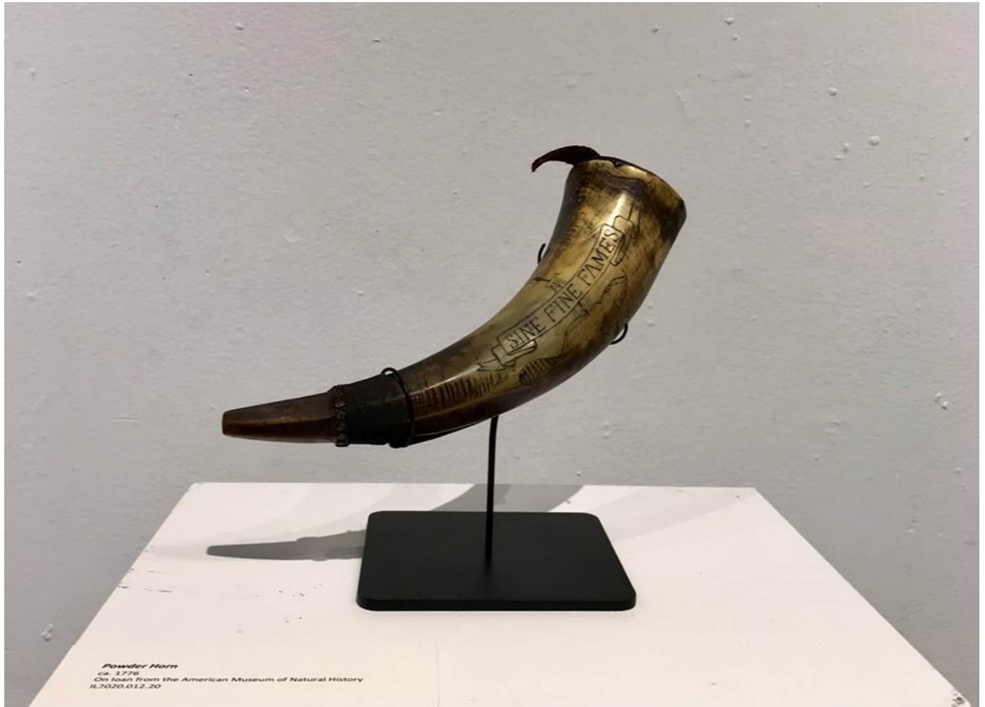
“Sine Fine Fames” 2021, Animal horn, leather, brass and lampblack, 28 x 18 cm, 11 x 7 in