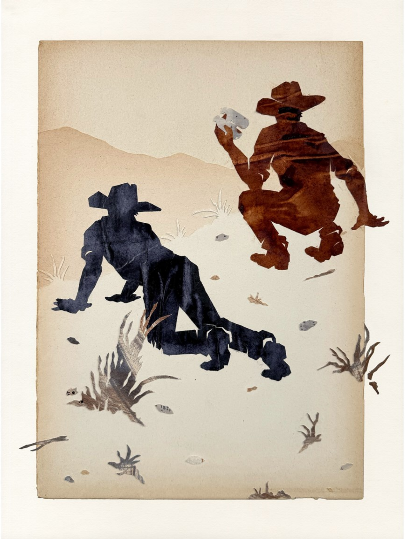
"Shellacked Cowboy XXXVI" 2024, Shellac ink on vintage paper mounted to panel, 41 x 31 cm, 16 x 12 in

GALLERY POULSEN CONTEMPORARY FINE ARTS - COPENHAGEN