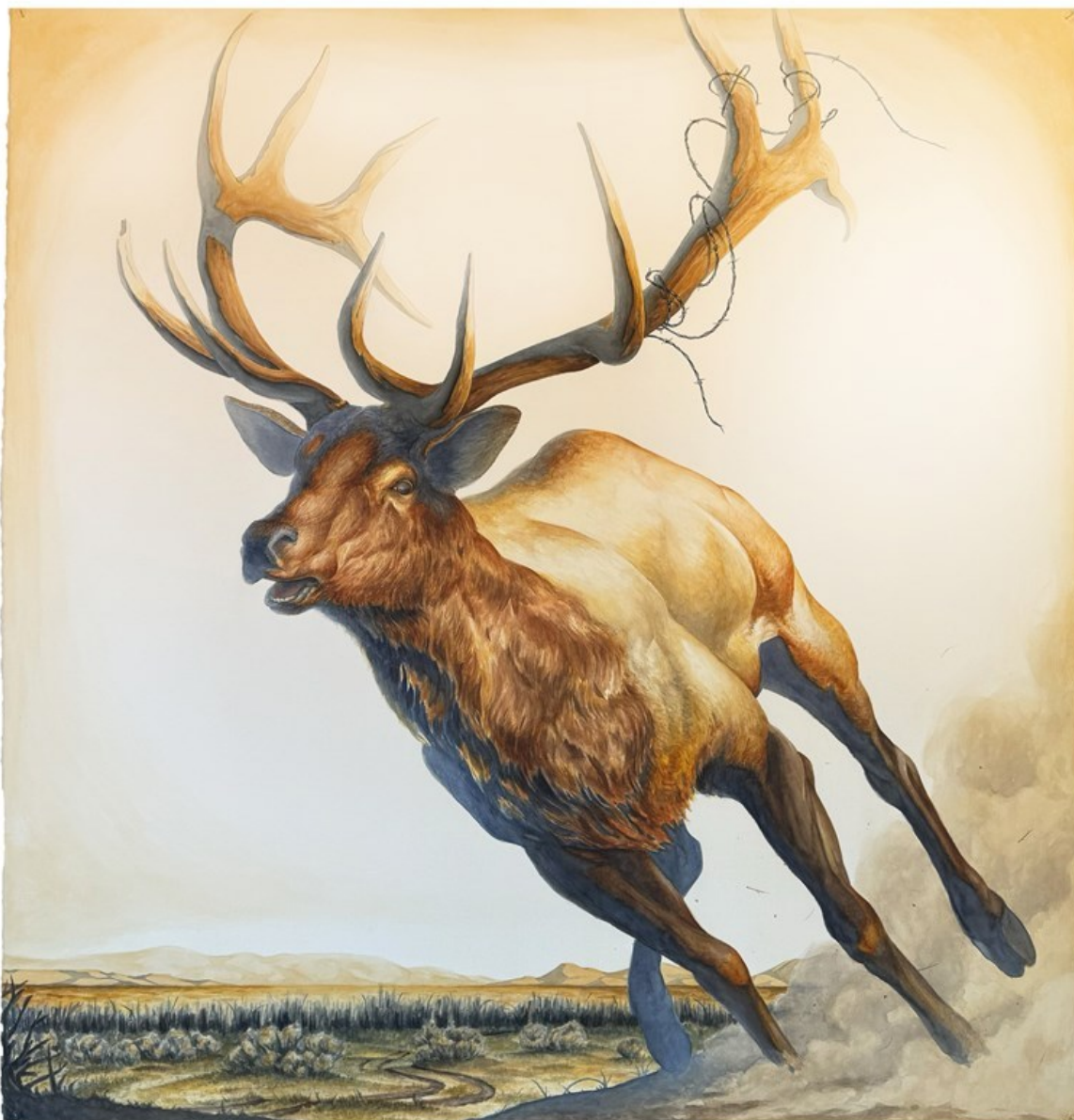
"Shifting Winds" 2025., Watercolor on paper mounted to canvas., 119 x 114 cm, 47 x 45 in

GALLERY POULSEN CONTEMPORARY FINE ARTS - COPENHAGEN