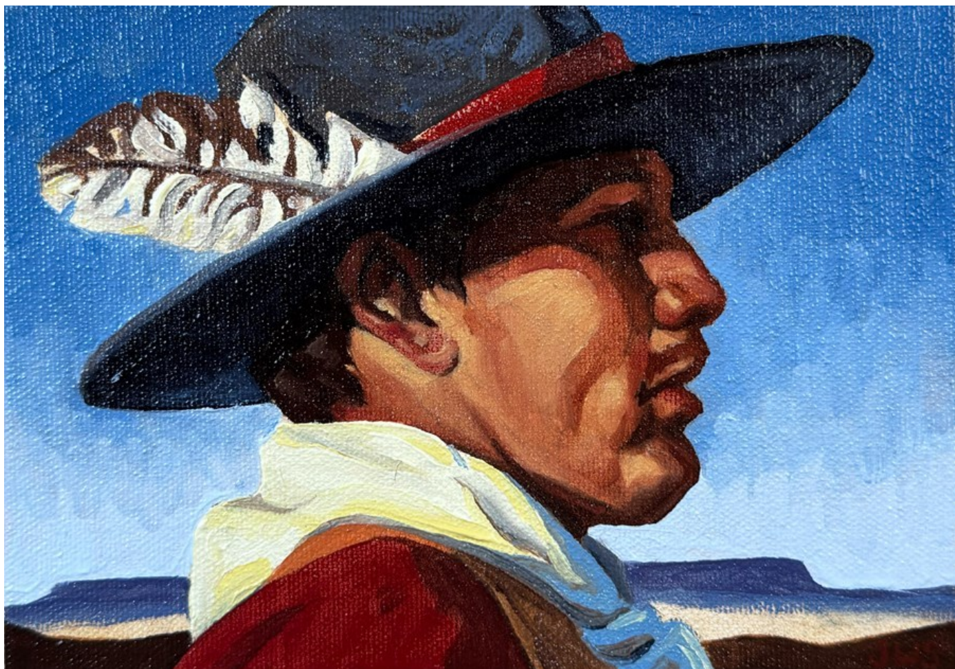
"Searching for Strays" 2025, Oil on canvas panel, 13 x 18 cm, 5 x 7 in, Framed in handmade walnut frame with double oak splined mitered joints

GALLERY POULSEN CONTEMPORARY FINE ARTS - COPENHAGEN