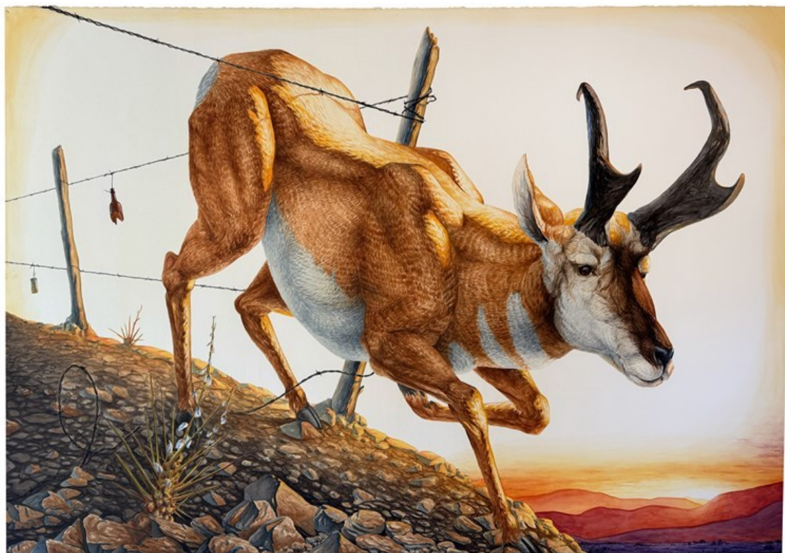
"Crossing Thru" 2025,, Watercolor on paper mounted to canvas, 114 x 166 cm, 45 x 65 in

GALLERY POULSEN CONTEMPORARY FINE ARTS - COPENHAGEN