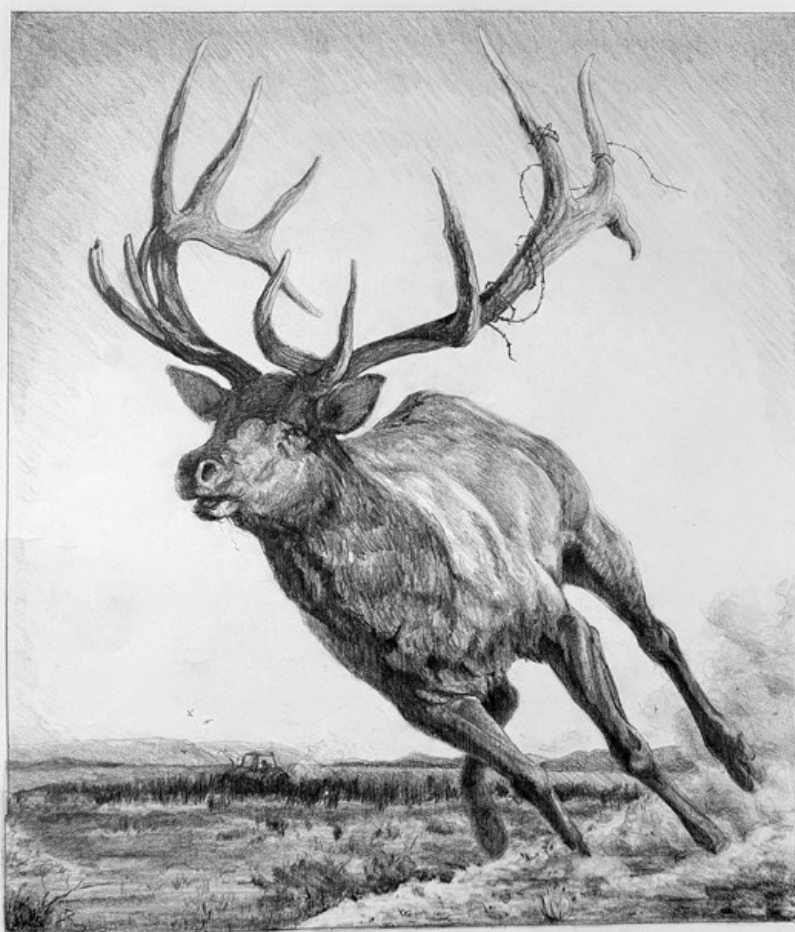
"Shifting Winds Compositional Drawing" 2025, Graphite on paper, 56 x 41 cm, 22 x 16 in (unframed), Handmade poplar frame

GALLERY POULSEN CONTEMPORARY FINE ARTS - COPENHAGEN