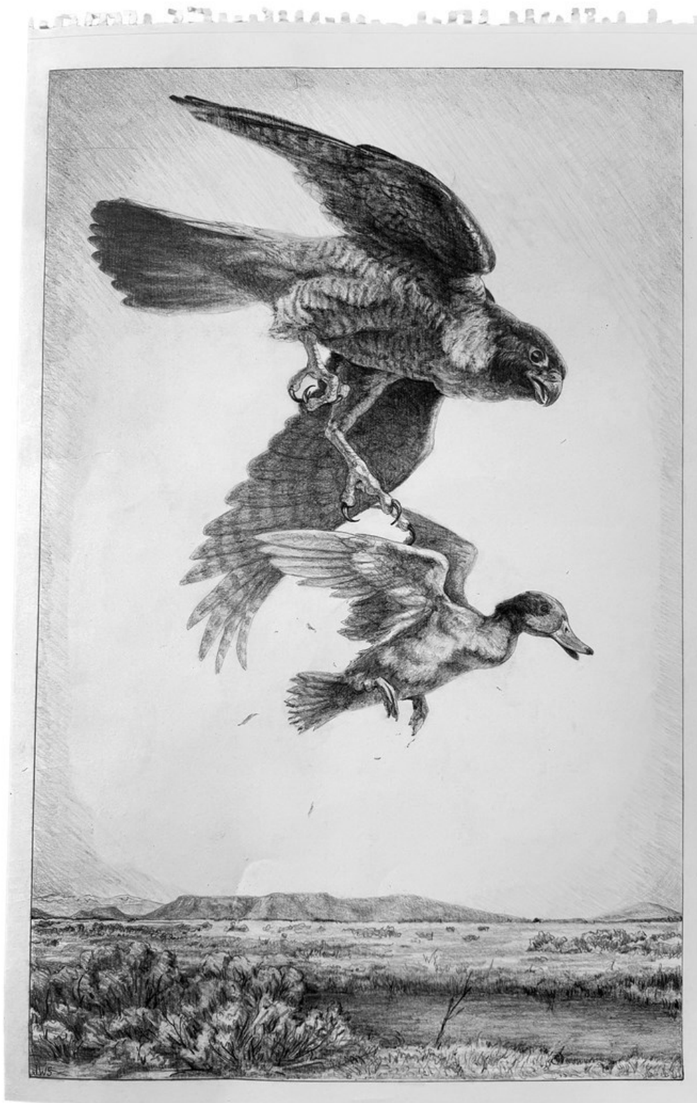
"Playa Blanca Compositional Drawing" 2025., Graphite on paper, 60 x 38 cm, 23,5 x 15 in, framed in handmade poplar frame

GALLERY POULSEN CONTEMPORARY FINE ARTS - COPENHAGEN