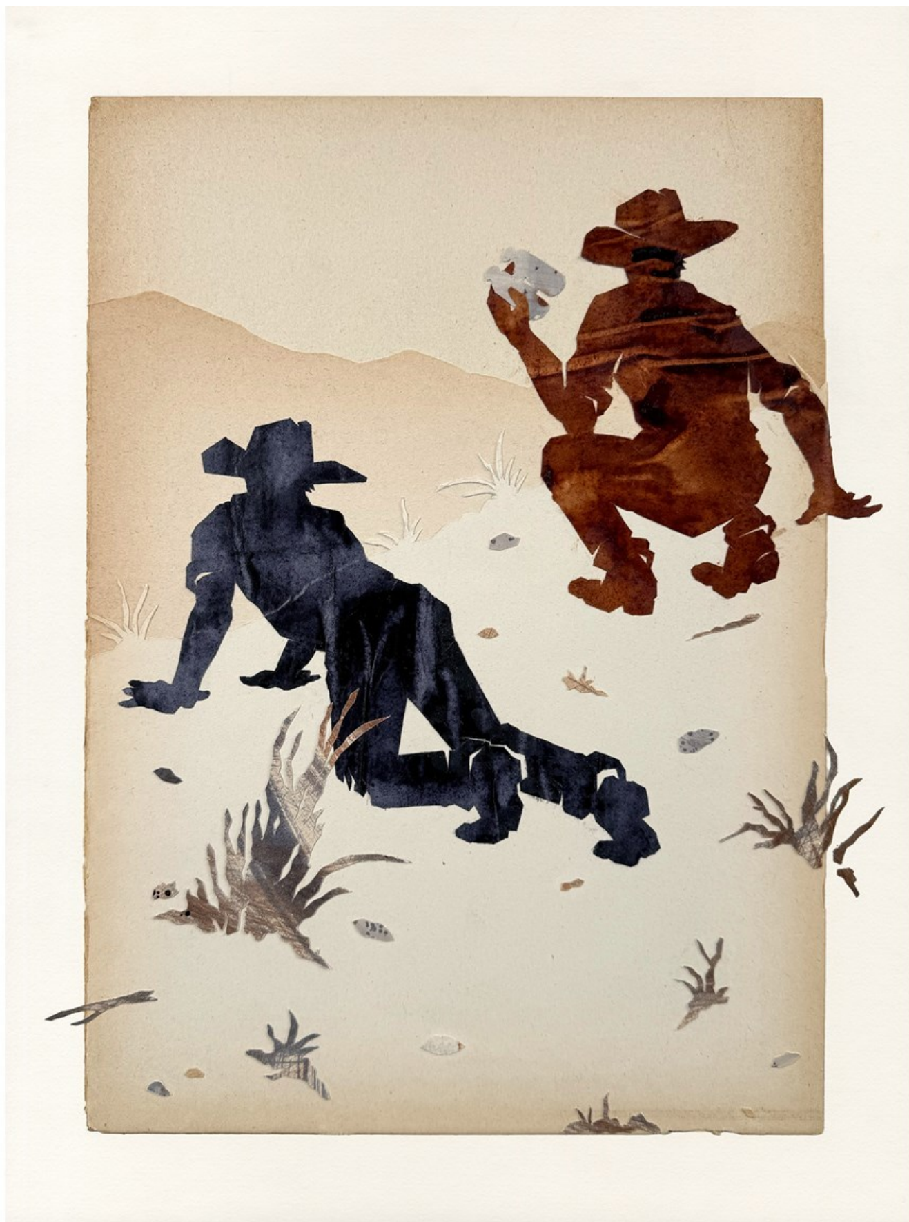
"Shellacked Cowboy XXXVI" 2024, Shellac ink on vintage paper mounted to panel, 41 x 31 cm, 16 x 12 in

GALLERY POULSEN CONTEMPORARY FINE ARTS - COPENHAGEN