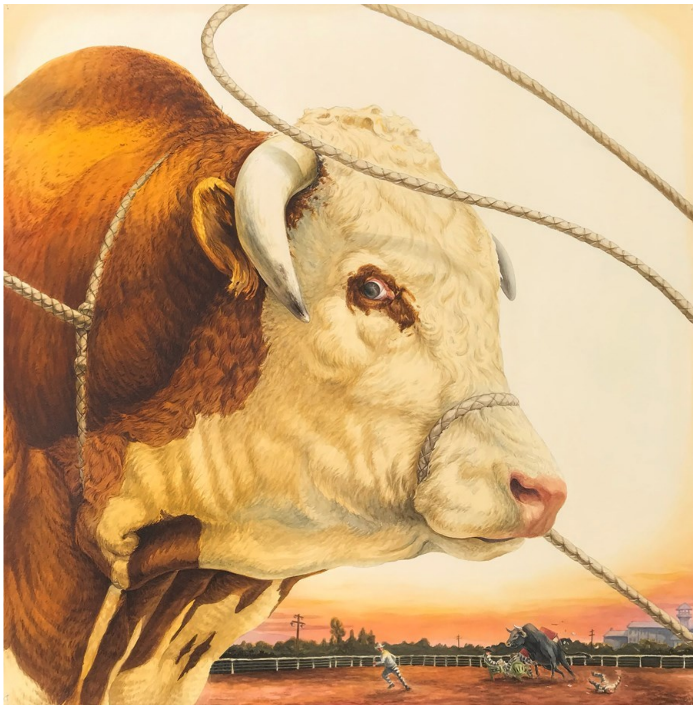
"Cowboy Poker" 2023, Watercolor on paper mounted to canvas, 101,5 x 101,5 cm, 40 x 40 in

GALLERY POULSEN CONTEMPORARY FINE ARTS - COPENHAGEN