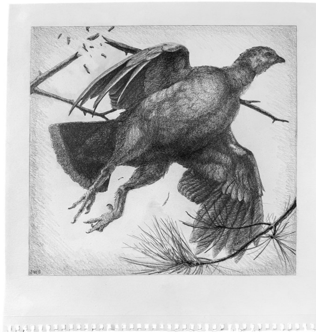
"Near Miss Compositional Drawing" 2025, Graphite on paper, 37 x 36 cm, 14,5 x 14 in, framed in handmade poplar frame

GALLERY POULSEN CONTEMPORARY FINE ARTS - COPENHAGEN