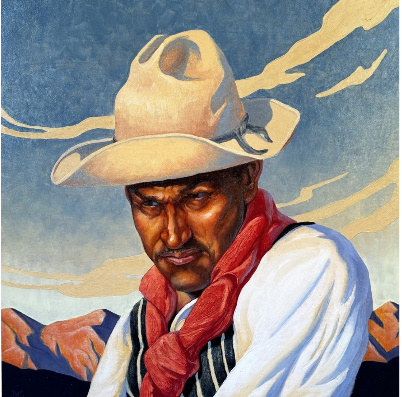
"Gaucho" 2025, Oil on panel, 46 x 46 cm, 18 x 18 in, Framed in handmade walnut frame with double oak splined mitered joints

GALLERY POULSEN CONTEMPORARY FINE ARTS - COPENHAGEN