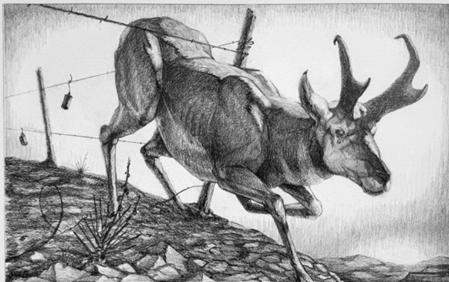
"Crossing Thru Compositional Drawing" 2025, Graphite on paper, 35 x 46 cm, 14 x 18 in, framed in handmade poplar frame

GALLERY POULSEN CONTEMPORARY FINE ARTS - COPENHAGEN