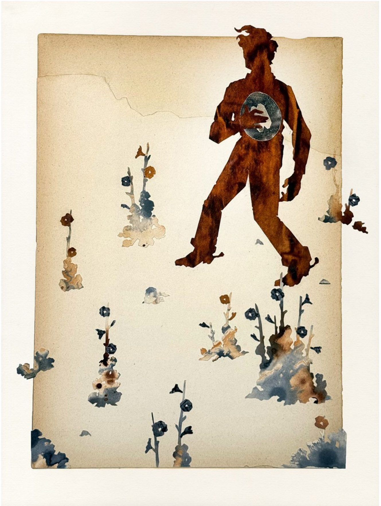
"Shellacked Cowboy XLV4" 2026., Shellac ink on vintage paper mounted to panel., 41 x 30 cm, 16 x 12 in,

GALLERY POULSEN CONTEMPORARY FINE ARTS - COPENHAGEN