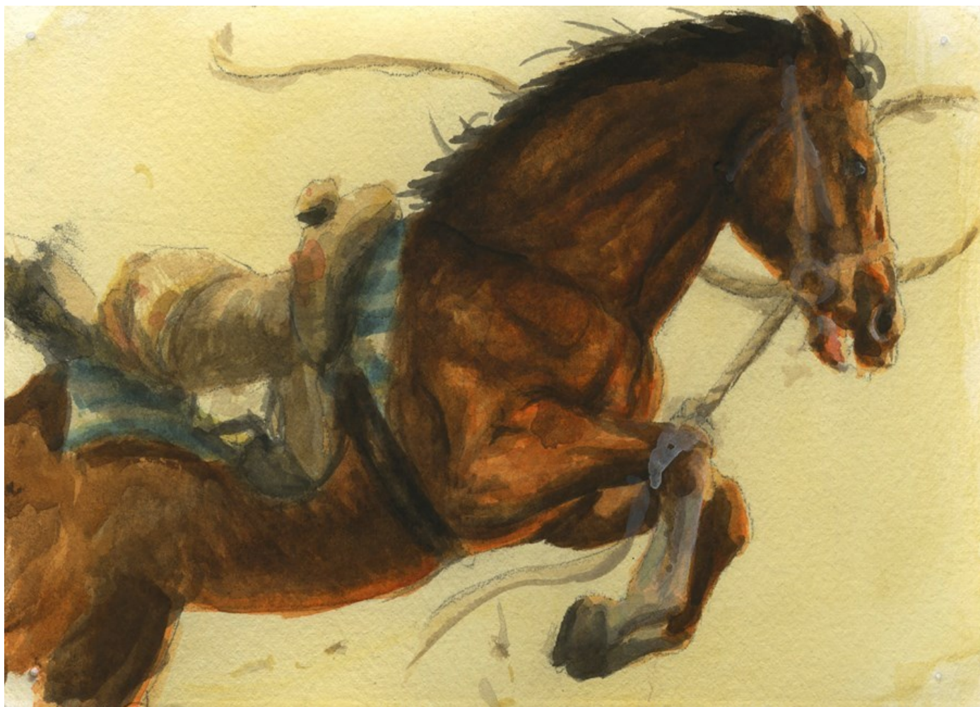
"Lost Mail Study, brown" 2021, Watercolor on paper, 20 x 25,5 cm, 8 x 10 in