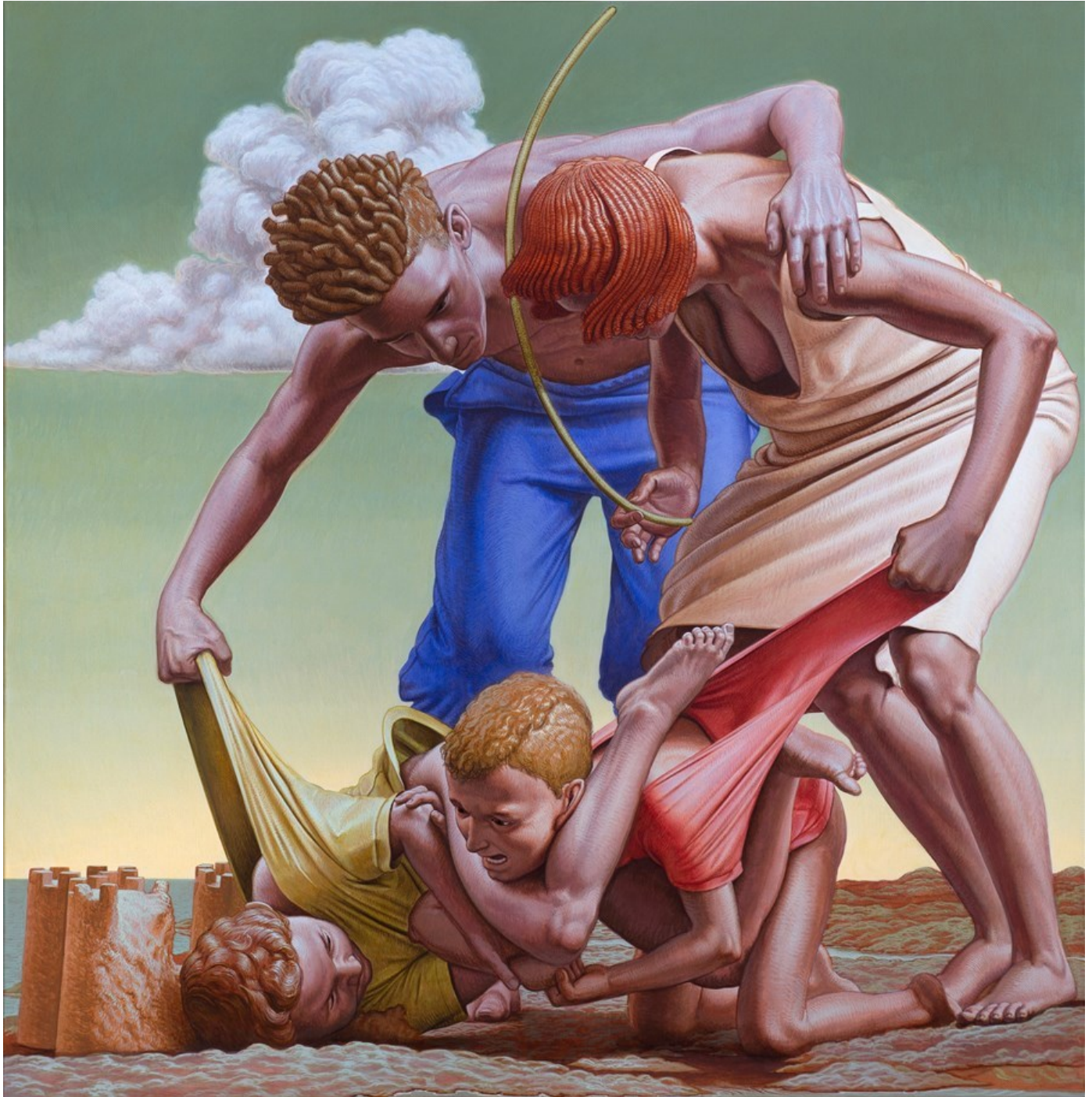
"The Knot" 2025., Acrylic on linen., 90 x 90 cm, 35 x 35 in

GALLERY POULSEN CONTEMPORARY FINE ARTS - COPENHAGEN