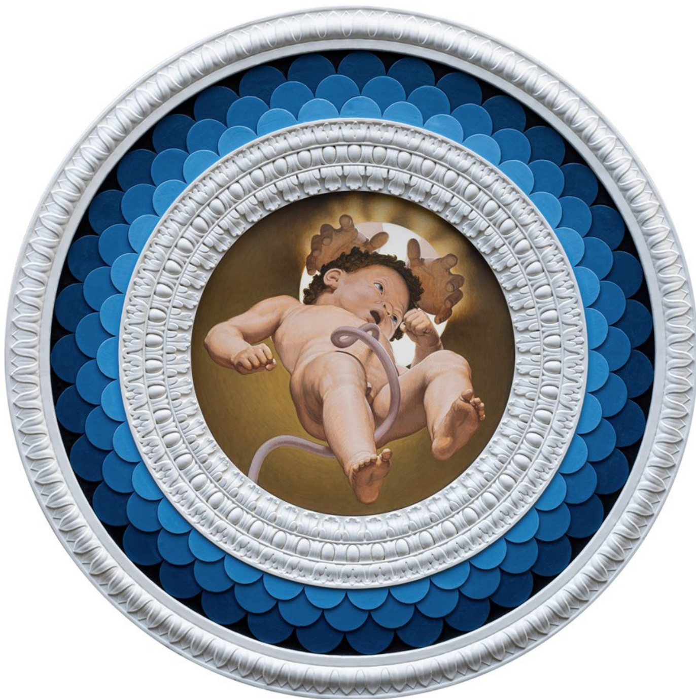
"The Most Beautiful Place I" 2025, Acrylic on wood framed in ceramic plaster, 72 cm in diameter, 28 in in diameter

GALLERY POULSEN CONTEMPORARY FINE ARTS - COPENHAGEN