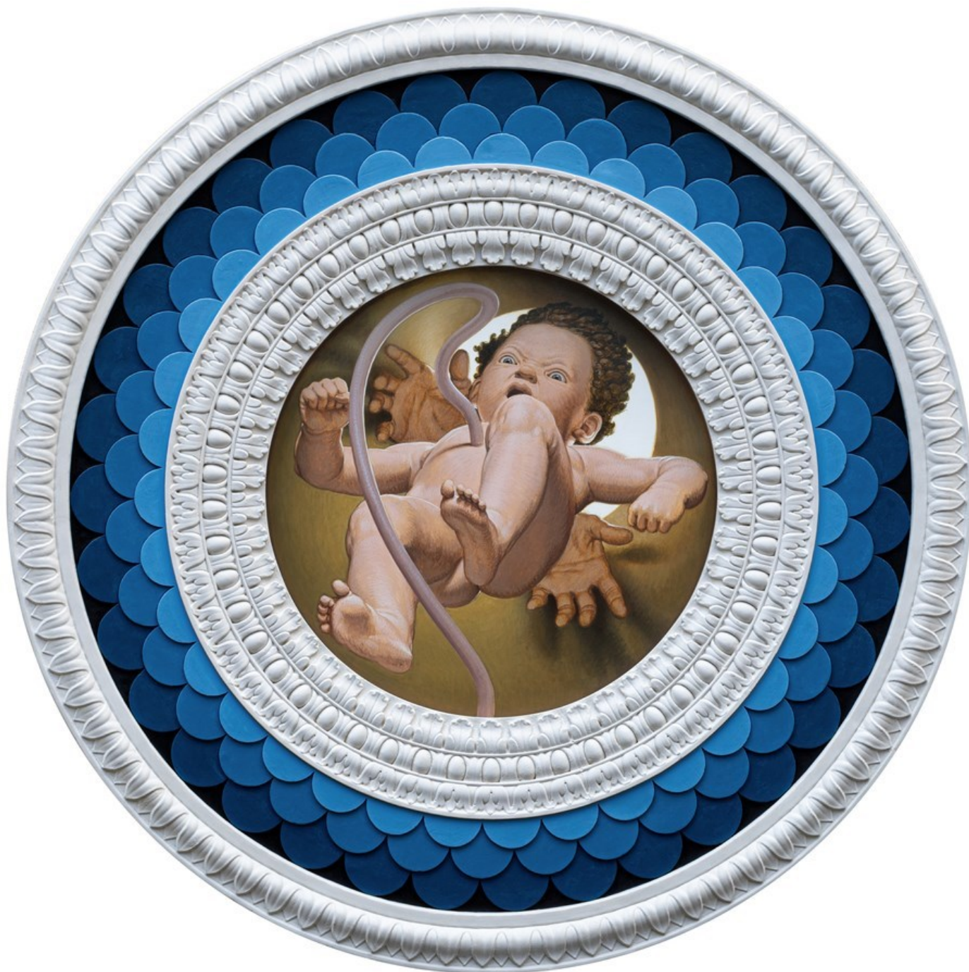
"The Most Beautiful Place II" 2025, Acrylic on wood framed in ceramic plaster, 72 cm diameter, 28 in in diameter

GALLERY POULSEN CONTEMPORARY FINE ARTS - COPENHAGEN